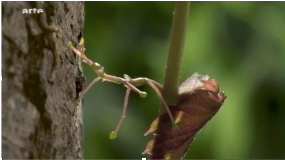
fig. 3. A still from the documentary "L'intelligence des arbres".

improvement of their position on the ladder of the living inherited from the past) is that apparently they don't move, and this absence of movement makes them nearer to non-living beings. So, it is not surprising that acceleration of plant movements is used in documentaries like "L'intelligence des plantes" and "Le murmure de la forêt. Quand les arbres parlent". In the first one, for example, the growth of an ivy on a trunk is accelerated, and the result is a sort of zoomorphic visual transformation (fig. 3).