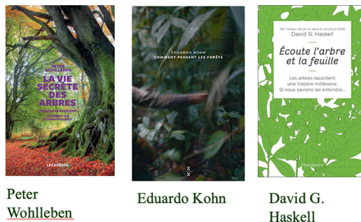
Fig 2: major bestsellers books published in France in 2017

2017 publications clearly mark a turning point: collections are opening up, the world of plants is decoded from a multitude of different angles, bestsellers are published (the works of Peter Wohlleben or Francis Hallé in France). This same year 2017 introduces another perception of nature and of the relationship with living beings: books such as " La vie secrète des arbres " (The secret life of trees, Wohlleben, 2017), " Écoute l'arbre et la feuille " (French translation of the book: " The Songs of Trees: Stories from Nature's Great Connectors ", Haskell, 2017), " Comment pensent les forêts " (2017, translation of the book: Kohn, E. (2013), How forests think: Toward an anthropology beyond the human , Univ. of California Press, 2013), or the issue of the popular science journal Sciences et vie (December 2017) mark a significant change.