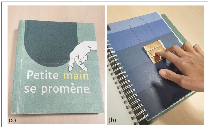
Figure 2. Book cover (a) and Page 1 of the multimodal book (b).

Follow this link to see a demo video of the multimodal book: https://drive.google.com/file/d/1he7izTbq69dTENLSmE8SxavvB1uy7Fpd/view?usp=sharing .