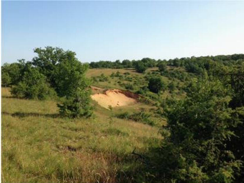
Fig. 4. Photograph of doline near Rocamadour.

the subsurface and then spring forth downstream into the course of the surface stream, Paramelle took this phenomenon as a universal. This idea may seem quaint to us, but in Paramelle's time, water was thought to flow primarily through natural underground conduits.