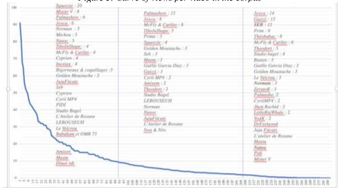
Figure 3: Curve of views per video in the corpus

Of those that work, 40 tracks in our corpus far exceed the size of the youtuber's community. Squeezeie alone has 20 music videos with over 10 million views. The most successful videos are all parody videos. Many of them combine several youtubers (Cyprien, Norman, Joyca, Maxenss, Maskey), or even rappers (Bigflo & Oli), a strategy that makes it possible to cross the capital of fame. Beyond the case of Squeezeie, for many youtubers (Inoxtag, Michou, Natoo, Norman, Cyprien), these are the videos that have generated the most views on their channel and sometimes with a big gap. For Norman, for example, the first two videos on his channel - both music videos - have 91 and 81 million views respectively, while his first comedy video has 37 million views. This seems logical because music, even parody music, can be listened to several times, which is helped by its limited duration of 3 to 5 minutes, unlike the usual videos of youtubers, which, according to our observations, are around 20 minutes long. The fact remains that the success of a music video is not guaranteed, if Norman manages to make clips that have made 91 million views, other big budget clips like "VALHALLA" (2021), inspired by the Wikings series, stagnates at 2 million views.