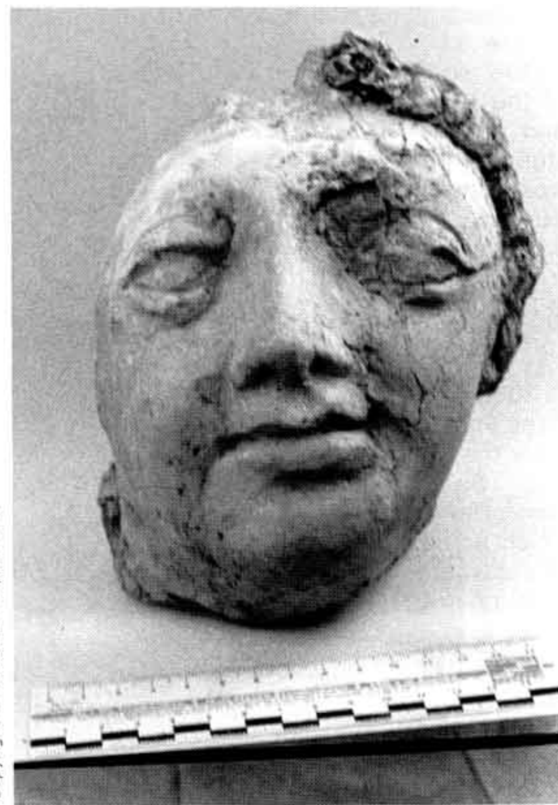
The head of a Buddhist divinity excavated at Bamiyan in 2003