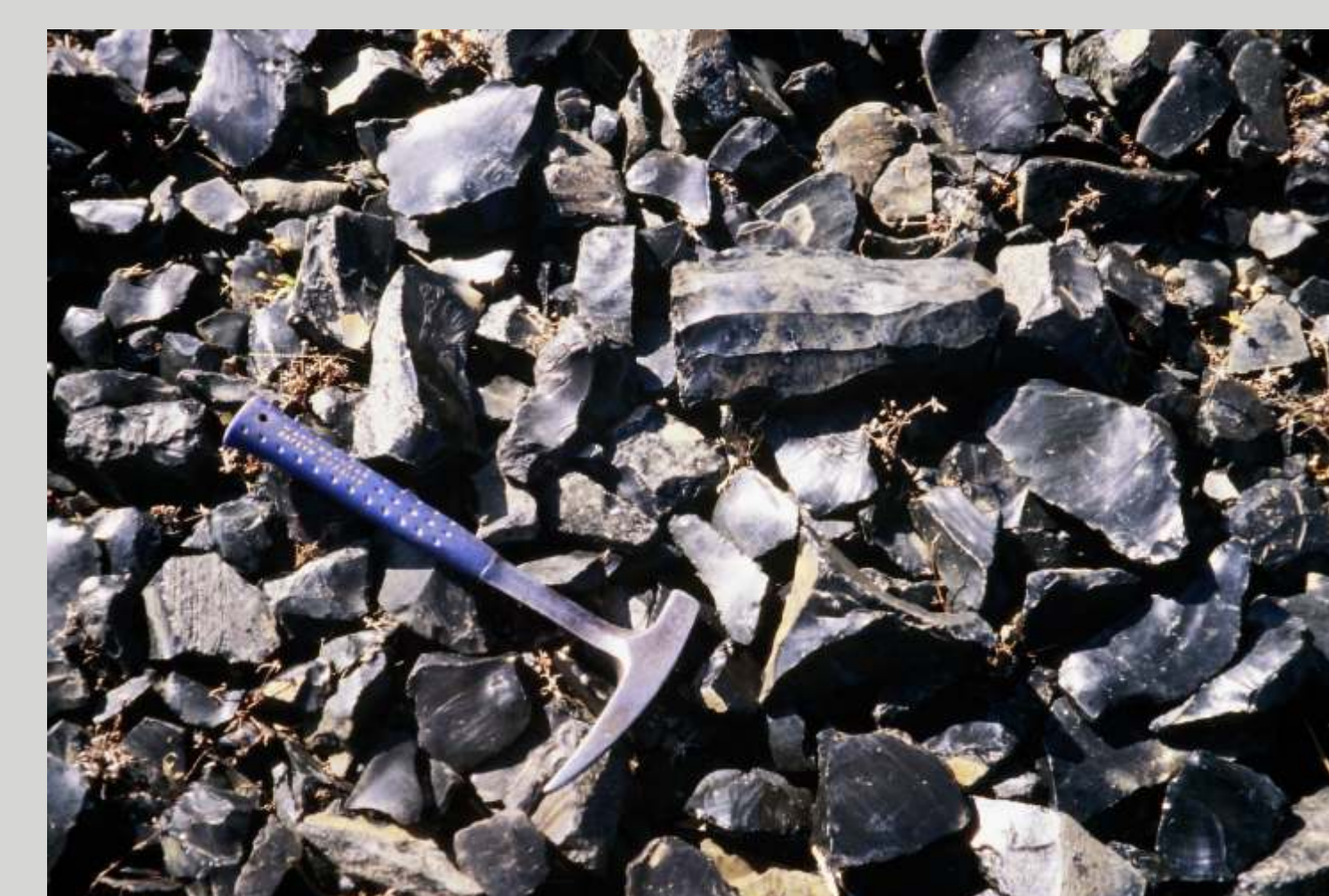
Close-up view of obsidian artefacts.

In the vicinity of Melka Kunture, obsidian is a major component of lithic series since the Oldowayan. The nearby Balchit volcanic massif constitutes a major obsidian source-area (Berthelet et al. , 2001). Since 1999, new investigations have been undertaken on the prehistory and volcano-sedimentary environments of Melka Kunture and a special attention was paid to obsidian artefacts and its primary and secondary sources. Analyses were performed on several obsidian samples from various locations, both in situ from a lava flow of Balchit and reworked debris or pebbles from different alluvial formations of the Awash river and its tributaries (Poupeau et al. , 2004).