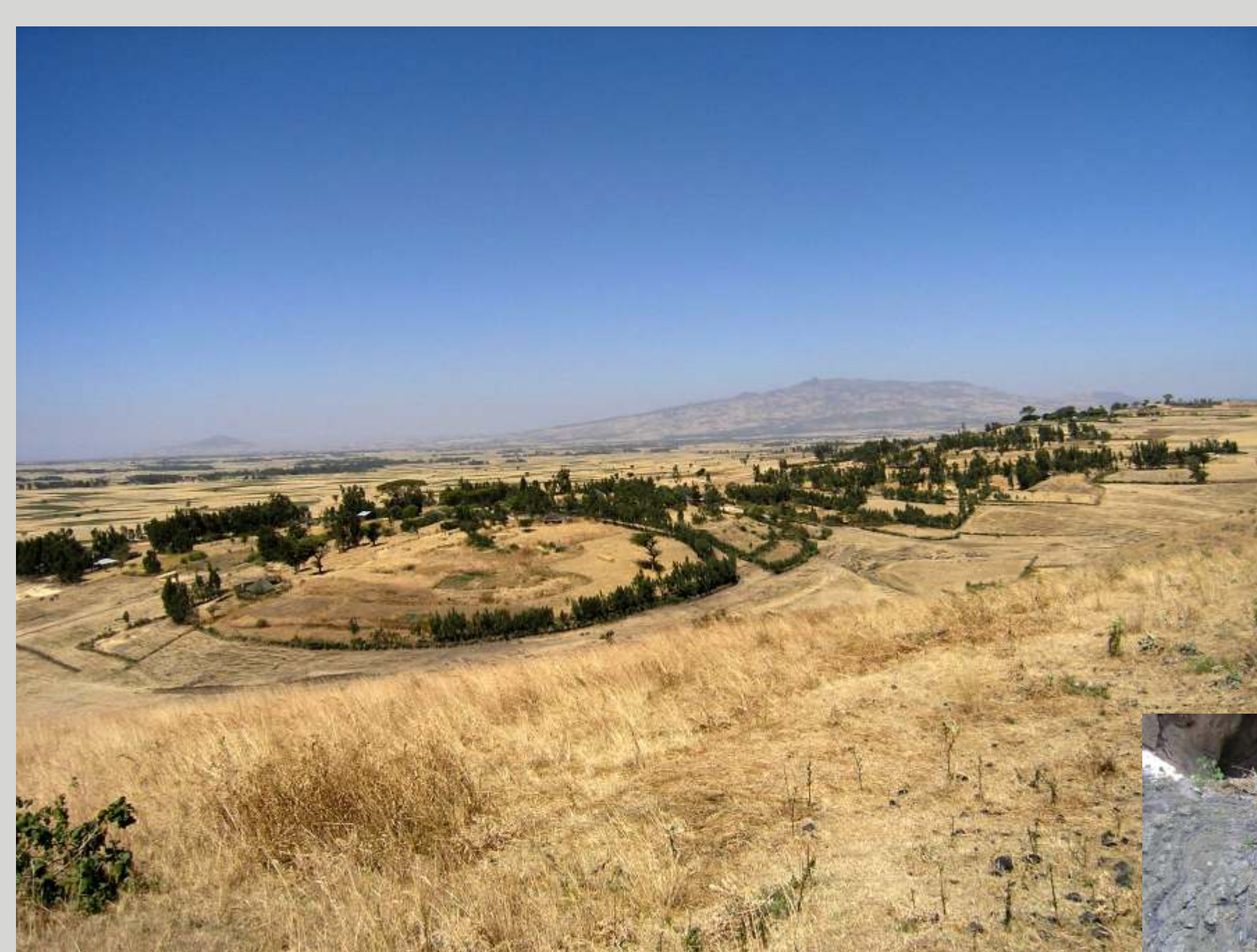
Balchit volcanic complex: view from top towards Balchit village with Wechecha volcano in background.