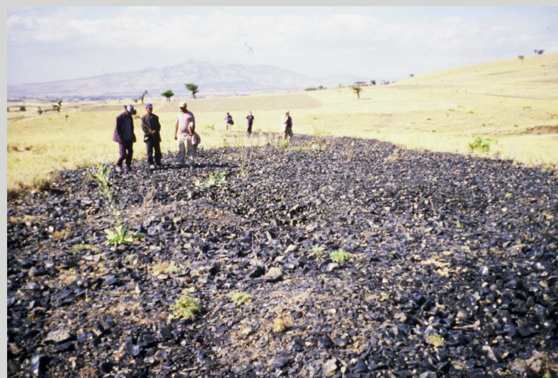
Accumulation of obsidian artefacts and debris.

The small volcanic massif of Balchit is one of the Pliocene silicic centers of the Wechecha Formation (Addis Ababa Rift Embayment). It is located some 25 km SE of Addis Ababa and 7 km NE of Melka Kunture, on the left interfluve of the Awash river (see map). One Balchit obsidian was recently dated at 4.37 \pm 0.07 Ma by K-Ar (Chernet et al. , 1998).