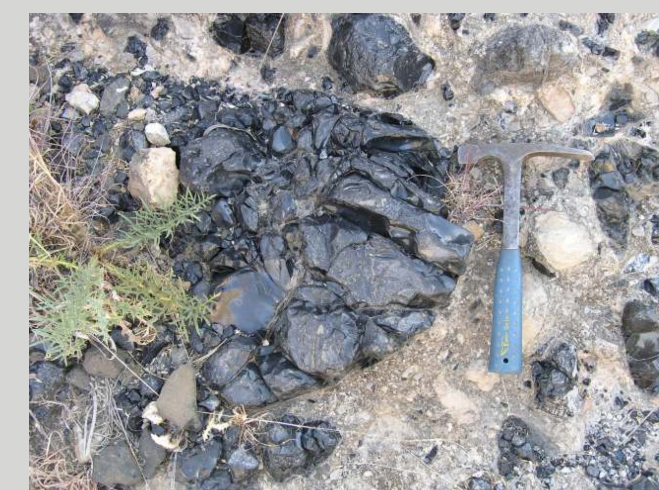
Unweathered massive block of obsidian.