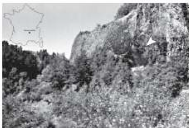
Fig. 1: The location of the rock-shelter site of Baume-Vallée (Abri Laborde).

The general poor state of preservation and the post-depositional alterations of the surface of the bones complicate the identification of possible traces. An eventual anthropogenic involvement in the capture and in the introduction of medium-sized birds usually not associated with caves (Anseriformes and Galliformes) still remains to be clarified. So far the taphonomic analysis has not shown any kind of trace of anthropogenic origin on the bird bones, but has brought to light traces of chewing by small carnivores. Future archaeozoological and taphonomical work on this avifaunal sample will perhaps provide an answer to this question.