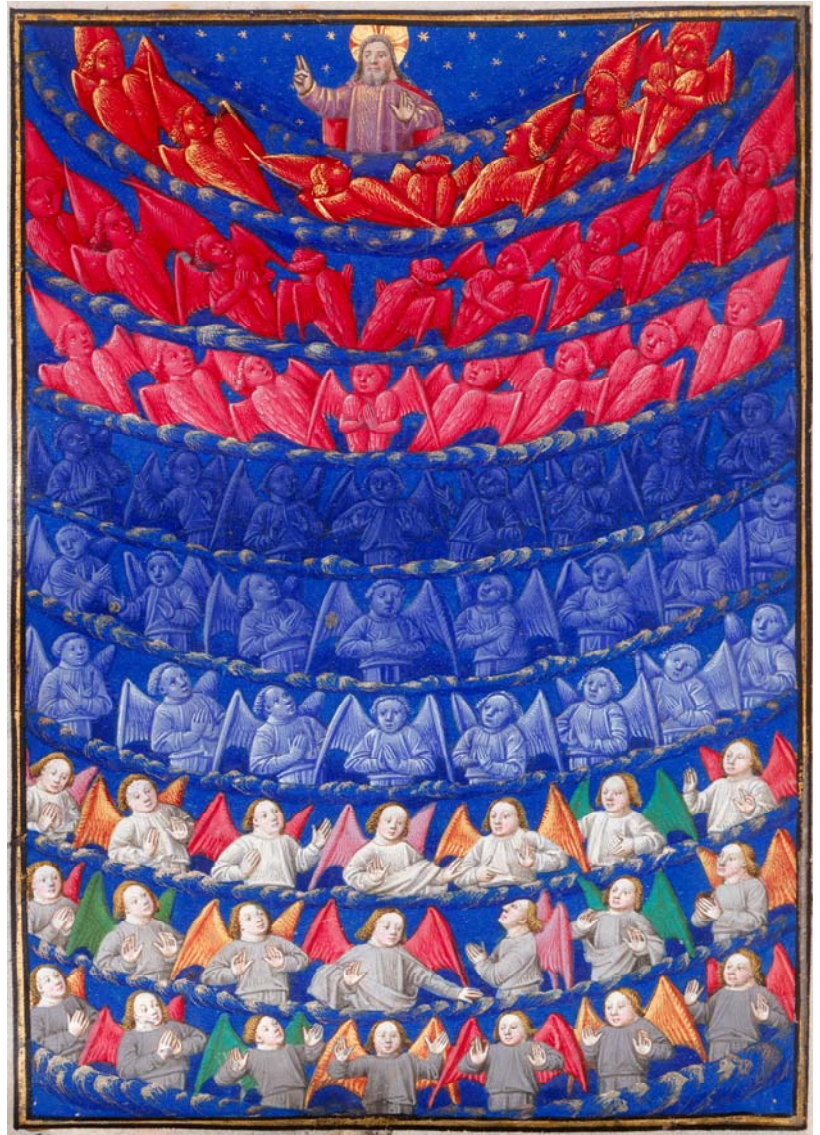
Figure 1: Vincent de Beauvais, Miroir historial. Speculum historiae 1463, BNF.

Thus it clearly appears that in Europe at the end of the 17<sup>th</sup> century the usage of the word hierarchy had shifted from a limited theological register to other registers outside the field of theology, at the same time undergoing certain alterations.