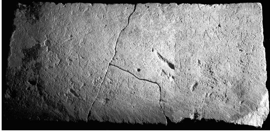
Figure 6 : Inscription 4