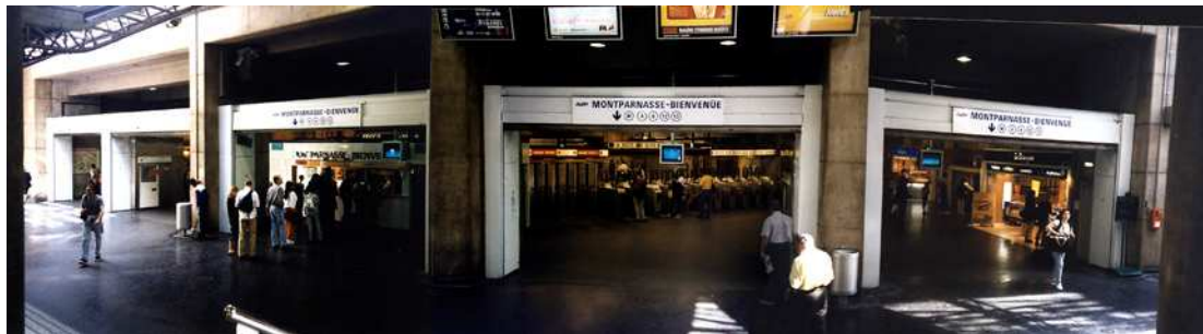
Gare Montparnasse – Underground level / entry-exit of subway