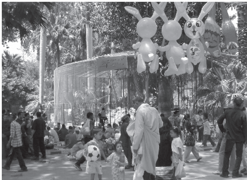
Families and children enjoying themselves at the zoo.

Families settle themselves on the numerous (but insufficient) benches, painted white and bottle-green, as well as in the spaces left open at the margins of the walkways. On this occasion especially, sitting on the grass is a liberty that visitors take, even against the interdictions posted on signs by the garden's administration. A tablecloth (a sheet, plastic mat, wool, or synthetic covering) performs several functions. The cloth is laid out and first, the woman—wife or mother—sits down and brings around her the children, the husband, sacks of provisions, plates, a music stand, the basket or package of food, and eventually, the football, the husband's shisha (water pipe), the stove for the tea, the children from other family groups. The density of the entire body renders the border between one family and the next almost unreadable. The tablecloth has an obvious function as a territorial marker whose integrity is more or less respected, particularly along the corridors between them. The other accessories are more mobile markers whose placement allows for negotiation with neighbors, expressed during the festival days through forms of courtesy and politeness: "Please, we'll make a place for you between us and our neighbors" (a space that the children already trample).