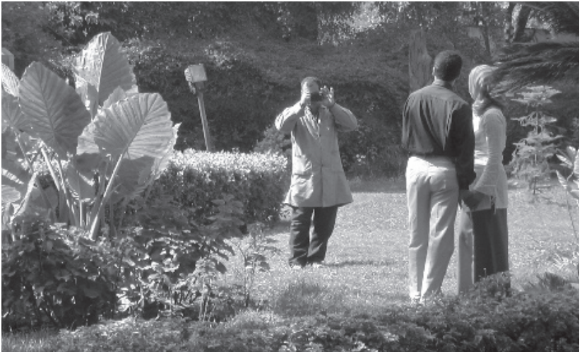
Couple being photographed and strolling in the zoo (photograph by Vincent Battesti).

dark glasses for the photo!” One of the couples decides to pose farther away, where the sunlight of the end of the day pierces some foliage. The boy and the girl lean symmetrically on one of the park’s floral lamps; the plants form the backdrop. The girl readjusts her blouse, smooths down her dress, straightens the pleats of her skirt and, finally, immobile, both of them look straight ahead at the camera lens. A little ill at ease, the boy only brightens his expression at the instant of the flash. The girl, gently smiling, seems defiant. Following the flash, the pose is kept a few seconds too long. Then all seem relieved.