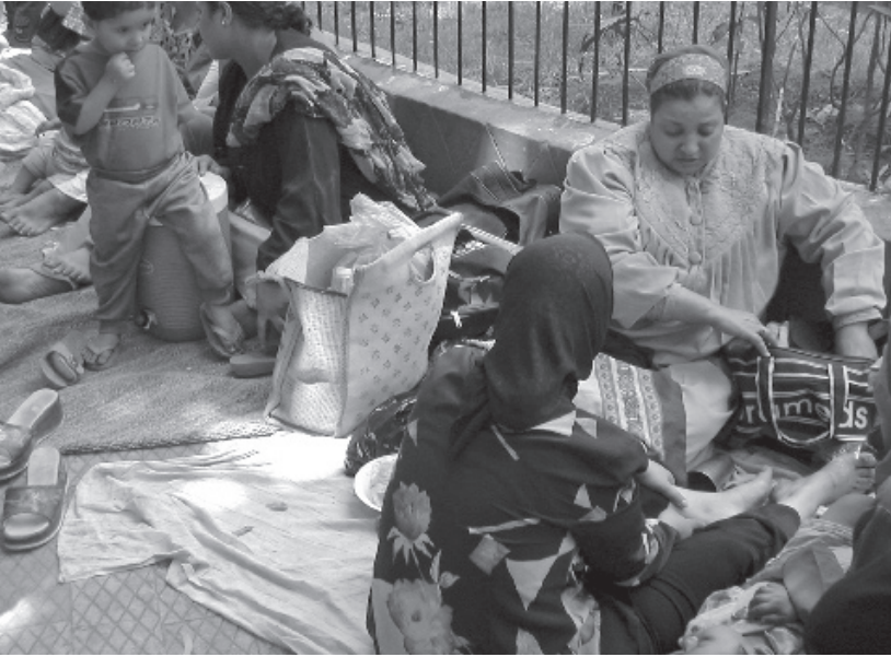
Families picnicking just outside the gates of the zoo during the holiday celebrating the end of Ramadan (photograph by Vincent Battesti).

from other groups (real, without being isolated either, except for couples that are not officially engaged) is coordinated according to the requirement of finding a 'good place' (sunny or shady, dry or elevated surface, fairly near to the fountains, etc). On this small domestic perimeter of tablecloth, unfolded in a public space and refolded when one leaves, the celebrating Cairene families at the zoo manifest the signs of the pleasant and bucolic recreation of a picnic, despite possible intrusions. The mothers' and wives' first gesture is to remove their sandals or shoes, leaving them on the tablecloth. They remain barefoot through the afternoon, while regularly pulling at their dresses to avoid the immodesty of exhibiting their legs. With this space conquered, the husband can explore at a greater distance with the children, taking them to see the giraffe, for example, whose success with the children is guaranteed. Using its long black tongue, the giraffe knows how to snatch, without fault, the carrot that is extended to it amidst shouts of fright and laughter.