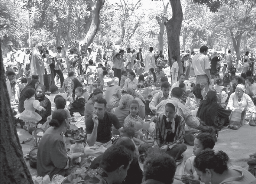
The crowds at the zoo during holidays.

about wandering in groups, invading the entire space given over to people, lingering; then suddenly agitated by a brusque change of regime, they run toward the larger crowd increasing its size. The object of these mobs is a fight breaking out, rather than an animal making a show, followed by nothing at all, a nonevent that fed upon the random attention of groups of visitors. The happy groups flow, occupying physical space to its smallest corners, attempting to penetrate the grottos, or spilling onto the forbidden lawns.