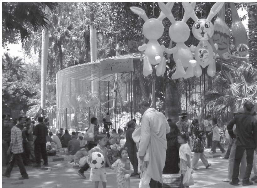
Families and children enjoying themselves at the zoo.

Families settle themselves on the numerous (but insufficient) benches, painted white and bottle-green, as well as in the spaces left open at the margins of the walkways. On this occasion especially, sitting on the grass is a liberty that visitors take, even against the interdictions posted on signs by the garden's administration. A tablecloth (a sheet, plastic mat, wool, or synthetic covering) performs several functions. The cloth is laid out and first, the woman—wife or mother—sits down and brings around her the children, the husband, sacks of provisions, plates, a music stand, the basket or package of food, and eventually, the football, the husband's shisha (water pipe), the stove for the tea, the children from other family groups. The density of the entire body renders the border between one family and the next almost unreadable. The tablecloth has an obvious function as a territorial marker whose integrity is more or less respected, particularly along the corridors between them. The other accessories are more mobile markers whose placement allows for negotiation with neighbors, expressed during the festival days through forms of courtesy and politeness: "Please, we'll make a place for you between us and our neighbors" (a space that the children already trample).