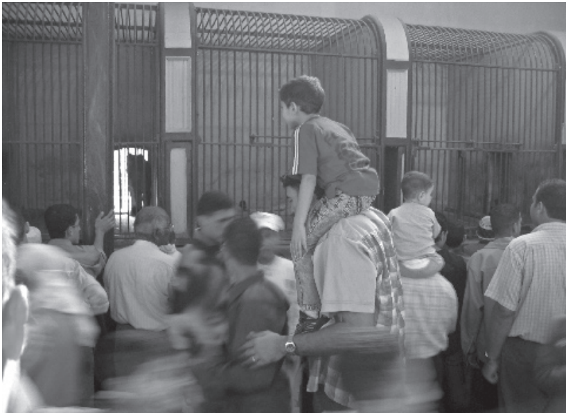
Visitors to the zoo view the caged animals (photograph by Vincent Battesti).

The zoo is usually a family destination. But during these few intense days, groups of youth and young couples swamp the families. However, families do not cede any territory; they bring their children with them, well dressed in their 'Id gifts, little suits for the boys and little white dresses for the girls—or wearing a complete wardrobe sold under plastic in stores, with flowered hat included. In all cases, parents have taken great care to make sure that children appear in their finest attire, costumed as angelically and child-like as possible; whereas the adolescents proudly display their brand-name 'Id gift outfits (Nike, Levi's, Adidas, etc., almost always counterfeit) and the indispensable accessories of the season. One can guess that parents, without being in their 'Sunday best,' have made a vestimentary effort as well. For men, pants and shirt are preferred. The gallabiya (long shirt-like garment that reaches the floor) would be gauche. Women wear dresses carefully matched with their headscarves. Women of popular quarters are identified by the way they wear their scarf knotted at the neck rather than under the chin. The appearance remains a strong marker of greater or lesser social ascension. The families circulate among the animal cages, following the children's vague desires to see the animals or to consume—ice cream, another cola, tiger or lion makeup, or an inflatable balloon in the shape of a deer or a giraffe.