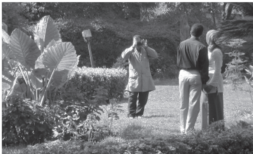
Couple being photographed and strolling in the zoo (photograph by Vincent Battesti).

dark glasses for the photo!” One of the couples decides to pose farther away, where the sunlight of the end of the day pierces some foliage. The boy and the girl lean symmetrically on one of the park’s floral lamps; the plants form the backdrop. The girl readjusts her blouse, smooths down her dress, straightens the pleats of her skirt and, finally, immobile, both of them look straight ahead at the camera lens. A little ill at ease, the boy only brightens his expression at the instant of the flash. The girl, gently smiling, seems defiant. Following the flash, the pose is kept a few seconds too long. Then all seem relieved.