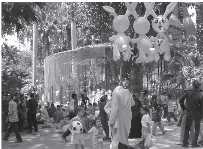
Families and children enjoying themselves at the zoo.

Families settle themselves on the numerous (but insufficient) benches, painted white and bottle-green, as well as in the spaces left open at the margins of the walkways. On this occasion especially, sitting on the grass is a liberty that visitors take, even against the interdictions posted on signs by the garden's administration. A tablecloth (a sheet, plastic mat, wool, or synthetic covering) performs several functions. The cloth is laid out and first, the woman—wife or mother—sits down and brings around her the children, the husband, sacks of provisions, plates, a music stand, the basket or package of food, and eventually, the football, the husband's shisha (water pipe), the stove for the tea, the children from other family groups. The density of the entire body renders the border between one family and the next almost unreadable. The tablecloth has an obvious function as a territorial marker whose integrity is more or less respected, particularly along the corridors between them. The other accessories are more mobile markers whose placement allows for negotiation with neighbors, expressed during the festival days through forms of courtesy and politeness: "Please, we'll make a place for you between us and our neighbors" (a space that the children already trample).