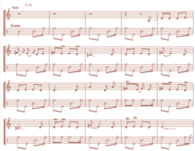
Fig.1b : Janaki's version. Tune 2 combined with a cycle of 2 beats.