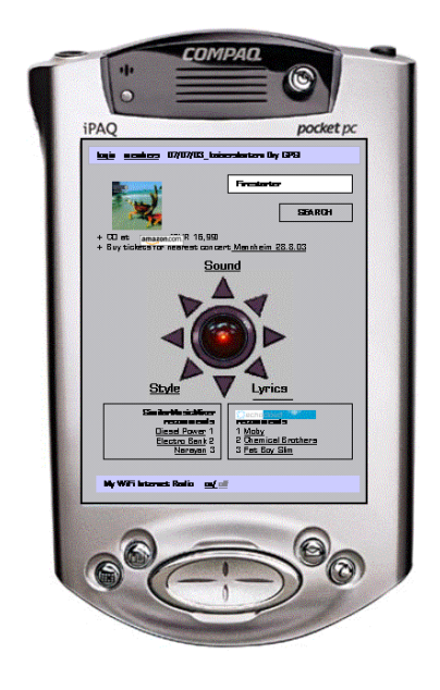
Figure 3: Mobile MIR application

Several prototypical systems combining different external web services and internal music processing agents have been realized in our previous work [22,23].