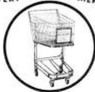
The NEST-KART with the Huge Capacity