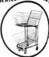
Usable with Any Type of Check-Out Counter

1 NEST-KART is the copyrighted trade mark of Folding Carrier Corp. NEST-KARTS are made under U. S. Patent No. 2479530—a valuable safeguard for users.