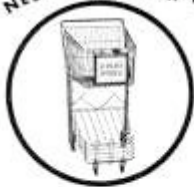
For the Average Sized Market