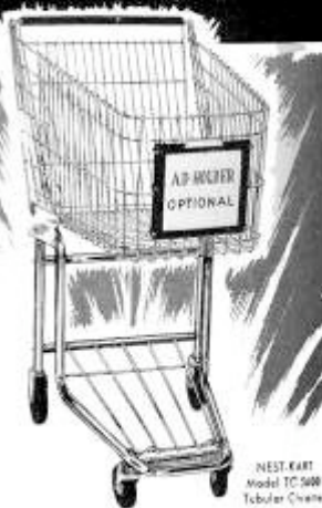
NEST-KART Model TC 5400 Tubular Chrome

Get all the facts about superior NEST-KARTS! Write us today for complete Catalog and Data Sheets.