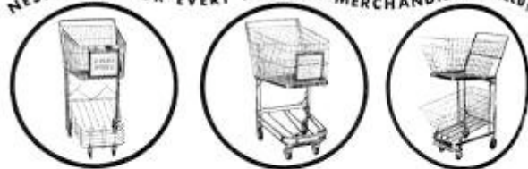
For the Average Sized Market