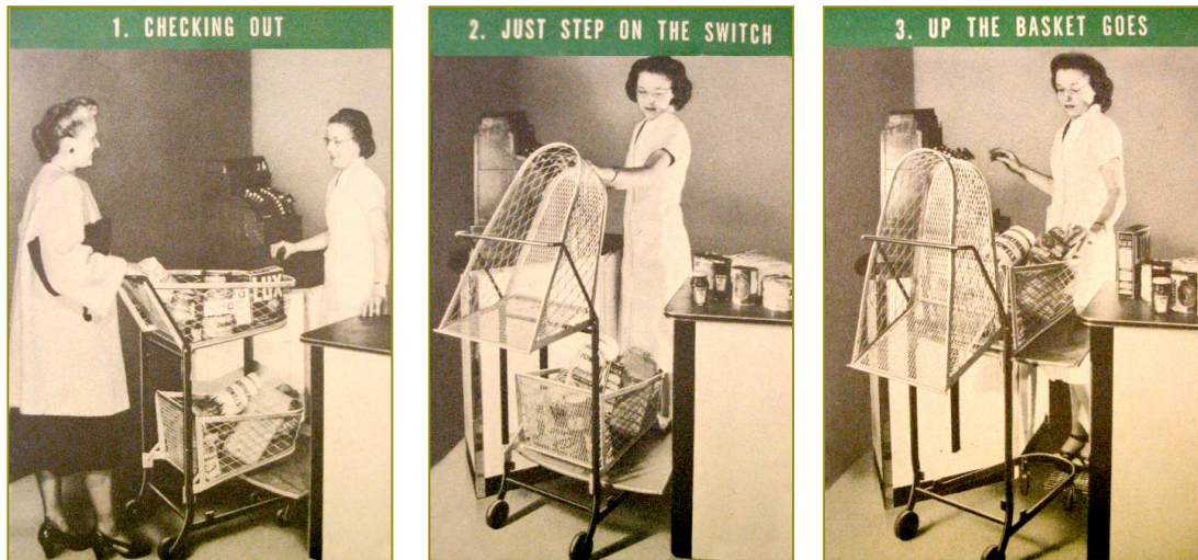
Telescope Carts, Inc. brochure (details), c.1947 “speeds check out, saves back-breaking” (TSCC, box 2, folder 3)

Despite the hopes placed in the “Power Lift”, as the system was called, and the interest in it — although this was moderated by the expensiveness of the system 29 —, Watson sold only a few copies, manufactured by him. The ingenuity, effort and care that had gone into the Power Lift seemed to have been in vain once the single-basket shopping cart came into general use. The patent application filed on 13 November 1946 was eventually withdrawn.