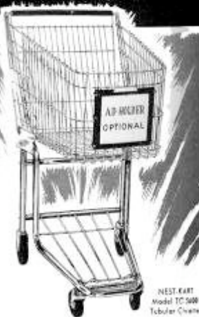
NEST-KART Model TC 5400 Tubular Chrome

Get all the facts about superior NEST-KARTS! Write us today for complete Catalog and Data Sheets.