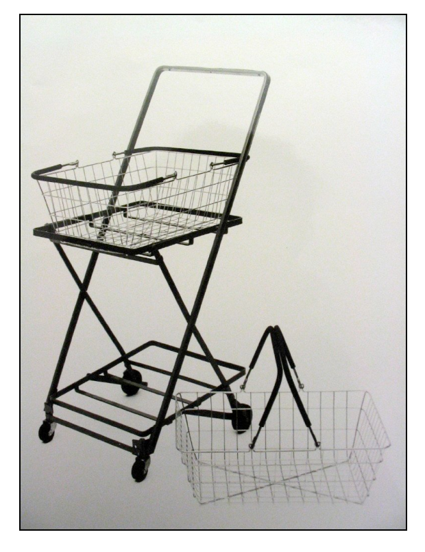
Sylvan N. Goldman's folding cart, c. 1937 (National Museum of American History, Smithsonian Institution) Note that the folding chair is still identifiable in the folding cart.

On June 4, 1937 Goldman placed an advertisement in the Oklahoma City press, showing a woman harassed by the weight of her shopping basket. "It's new – It's sensational. No more baskets to carry" promised the advert – without any information as to how this miracle would occur. This was a (anticipated?) form of teasing, the advertising tactic that plays on the reader's curiosity to draw attention to the message. But rather than appearing in the following week's edition, the solution to the riddle was to be found in the real world. Readers were simply required to turn into customers and to visit Goldman's shops where a hostess offered them basket carriers.