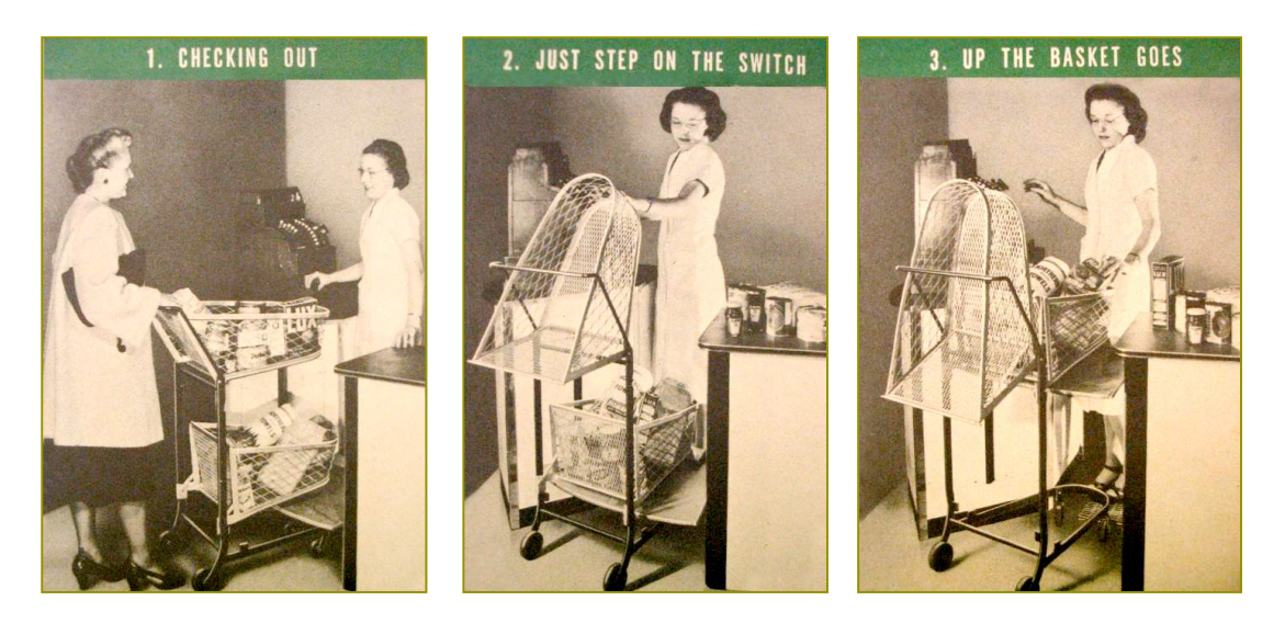
Telescope Carts, Inc. brochure (details), c.1947 "speeds check out, saves back-breaking" (TSCC, box 2, folder 3)

Despite the hopes placed in the "Power Lift", as the system was called, and the interest in it — although this was moderated by the expensiveness of the system<sup>29</sup> —, Watson sold only a few copies, manufactured by him. The ingenuity, effort and care that had gone into the Power Lift seemed to have been in vain once the single-basket shopping cart came into general use. The patent application filed on 13 November 1946 was eventually withdrawn.