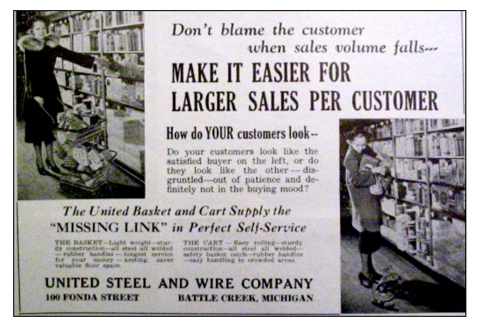
United Steel Advertisement, SMM, May 1937

four cart manufacturers advertised in SMM <sup>21</sup>. These enable us to follow the genealogy of the shopping cart with far more continuity than in the one reported by Goldman.