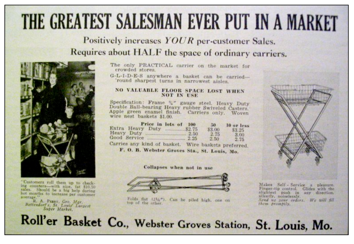
First advertisement for a folding cart in SMM, May 1937

It is difficult to know exactly what inspired Goldman, as the project he had in mind seems really different from the one described years later. There was indeed another Goldman's cart before the official "first shopping cart"... The earliest illustrated advertisements of the Folding Carrier Corp., published in Super Market Merchandising , shows a cart bearing strong resemblance to a folding chair and which, when unfolded, formed not a seat but a sort of folding basket integrated into the structure<sup>22</sup>. This corresponded to the first Goldman's patent and what was probably the first real shopping cart , not simply a basket carrier.