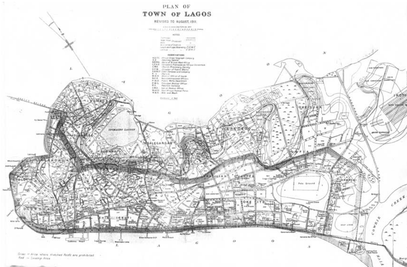
Map 1. Lagos Island in 1911.