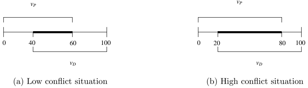
Figure 1: Conflict situations used in the experiment

Note. In each Figure, v_P denotes the private value of the plaintiff, v_D the private value of the defendant. The bold line illustrates the conflict zone settled by the treatment, set either to Low conflict (Figure a) or High Conflict (Figure b).