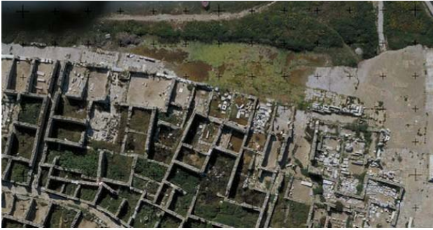
Figure 1. An vertical photo showing Delos vestiges (with a squaring for future adjustments).

More generally, as a specialist in photogrammetry, the surveyor contributes to apply imaging techniques to archaeology (Table 2).