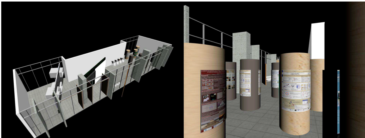
Figure 3: 3d final representations of the project.

The collaboration around this project of design took three months. One distinguishes two great phases from work: (1) definition of the contents and the place of exhibition and (2) design of the exhibition itself. At the end of collaboration, we have reached a level of rather fine detail of exhibition spaces, without entering, however, in a technical level of detail. The project in its current state is ready to be submitted to the various institutions for fund raising.