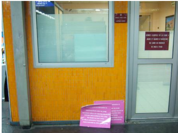
Photo 1. Two pink boards removed