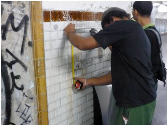
Photo 8. Measuring