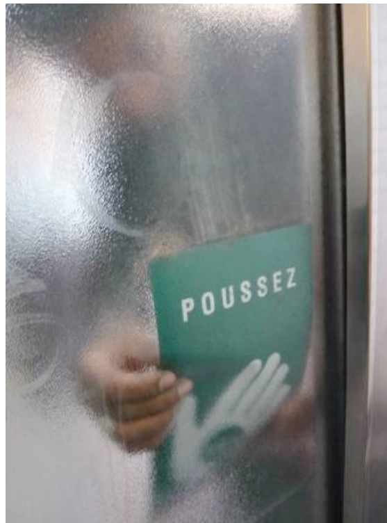
Photo 5. Putting up a sticker

A third way to handle signs noticeably wanders from reading. It implies to identify the right position for a graphic object in showing concern about the action it is supposed to support. The "push" sticker that has to be stuck on certain doors is a typical example for such a situation. Not only it must be placed for riders to see it, but also its emplacement has to indicate where one has to put the hand to properly open the door (photo 5).