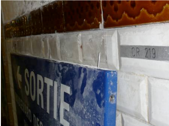
Photo 10. The new board, still dirty