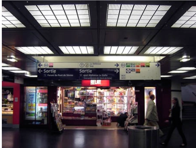
Photo 18. An existing board