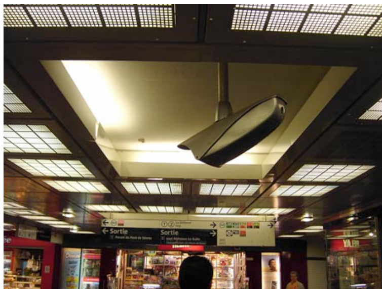
Photo 20. The board, among other objects