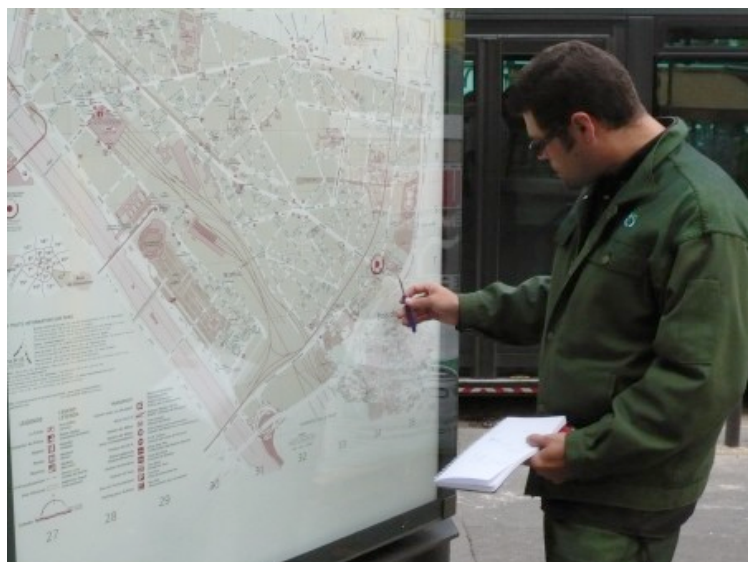
Photo 4. Reading a neighborhood map to confirm a choice