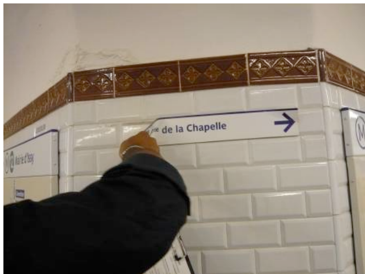
Photo 14. Removing a provisory board