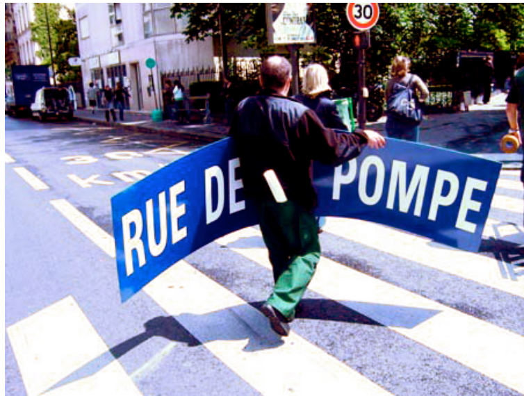
Photo 7. Carrying a board

Material features of each sign play therefore an important part in the placement work. It involves a lot of manual operations, tools, and skills.