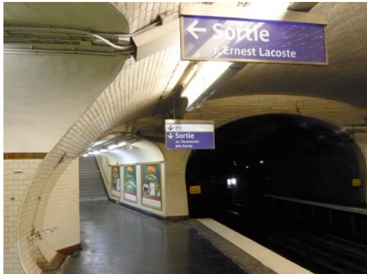
Photo 3. Exit boards to be replaced to include the museum name