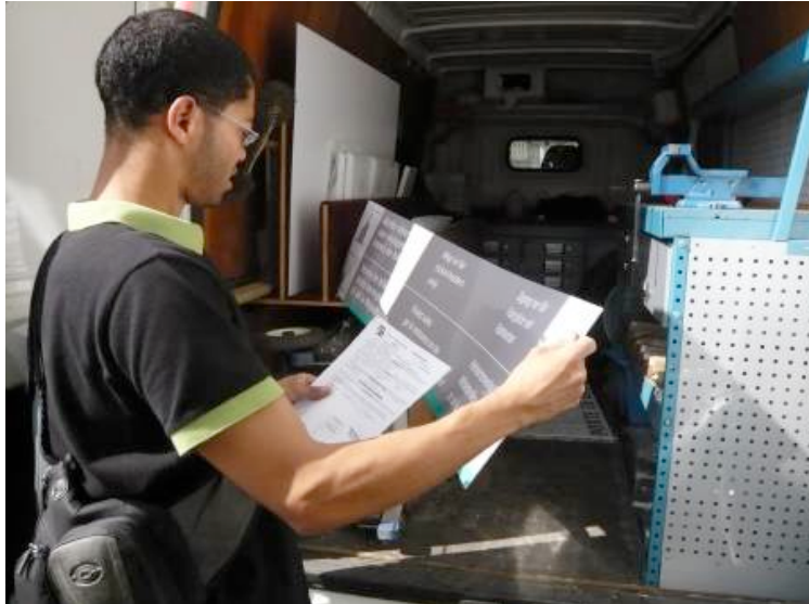
Photo 2. Checking out a board to deduce its location