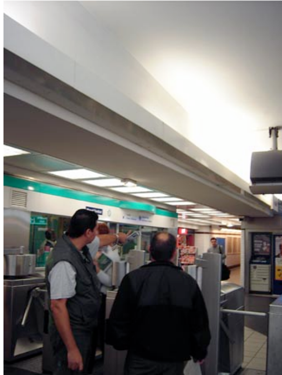
Photo 19. Discussing possible emplacements for future boards