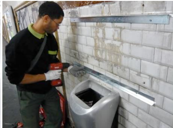
Photo 9. Drilling