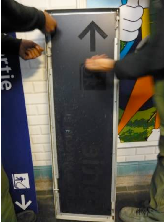
Photo 12. Removing screws

Once it is done, they put up the new plaque very carefully: a false move could definitively damage it. Then they screw back the frame before hanging it up on the ceiling.