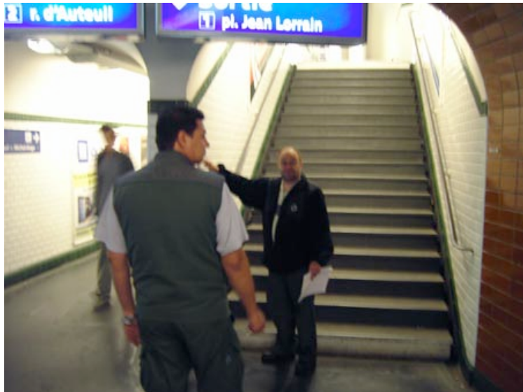
Photo 13. Choosing a future board position

Keeping a close watch at other signs is not relevant only for the placement work. It is also a way to take initiatives for displacements, indeed removals, of certain boards.