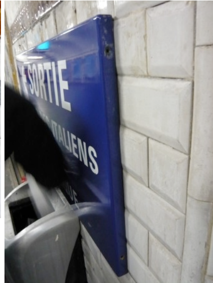
Photo 11. Wiping