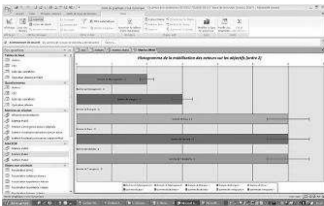
Figure 3: histogram of adherence of the participants to goals