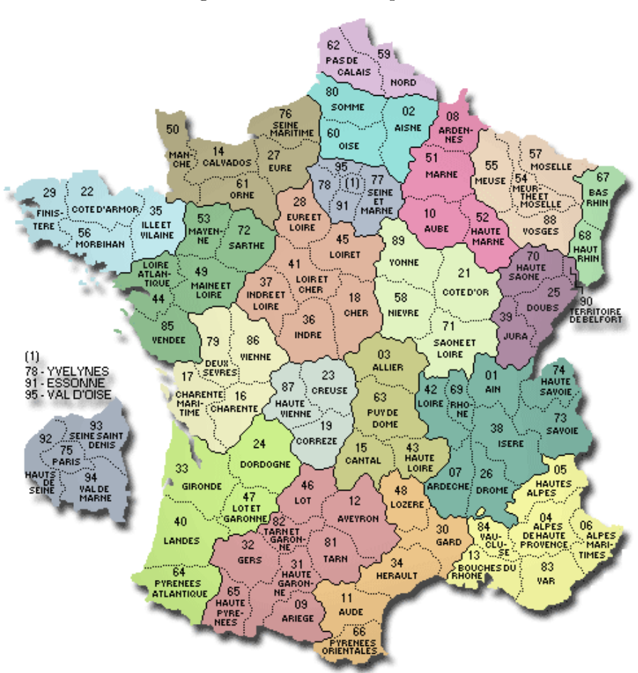
Figure A.1: French "départements"