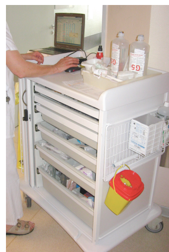
Figure 3 - Trolley to transport notebooks, 2008.