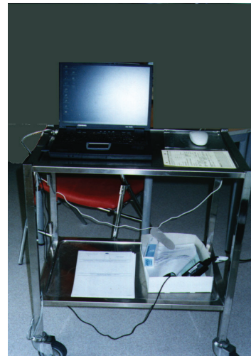
Figure 1 - Trolley to transport notebooks, 2003.

Our observations in 2003 demonstrated that the software was used intensely and systematically, confirming the reputation of the unit of being open to new technologies. The doctors made their prescriptions, modifying them according to the evolution of the patient. The nurses accessed and printed the therapeutic regimens and the Plans for Drug Administration and validated them after administration of the medicines.