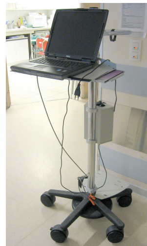
Figure 2 - Trolley to transport notebooks, 2008.