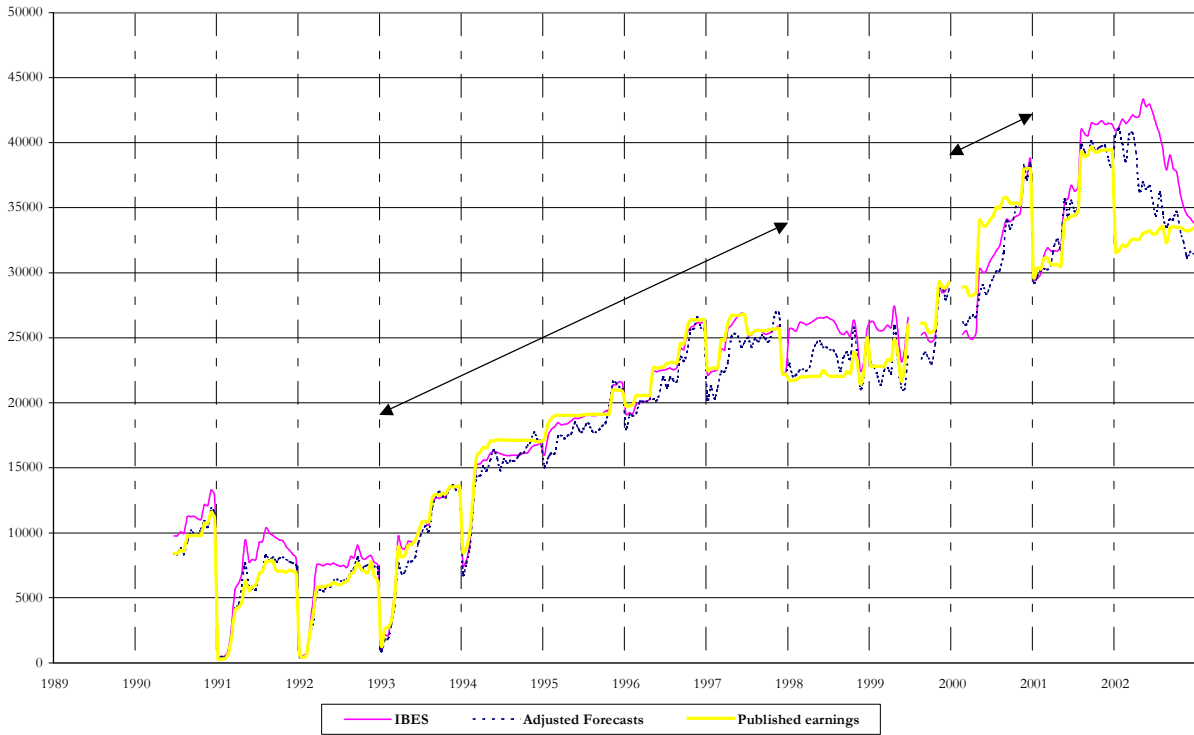
Figure 2- Last forecast before publication (“published earnings”), Forecasted (“IBES”) and Adjusted Earnings (“Adjusted forecasts”) for UK