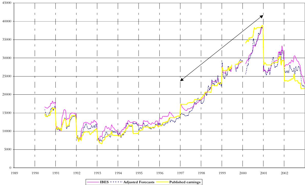
Figure 3- Last forecast before publication (“published earnings”), Forecasted (“IBES”) and Adjusted Earnings (“Adjusted forecasts”) for France