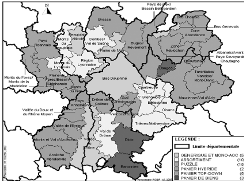
FIGURE 2 Typology of territorialized complex goods in the Rhône-Alpes région