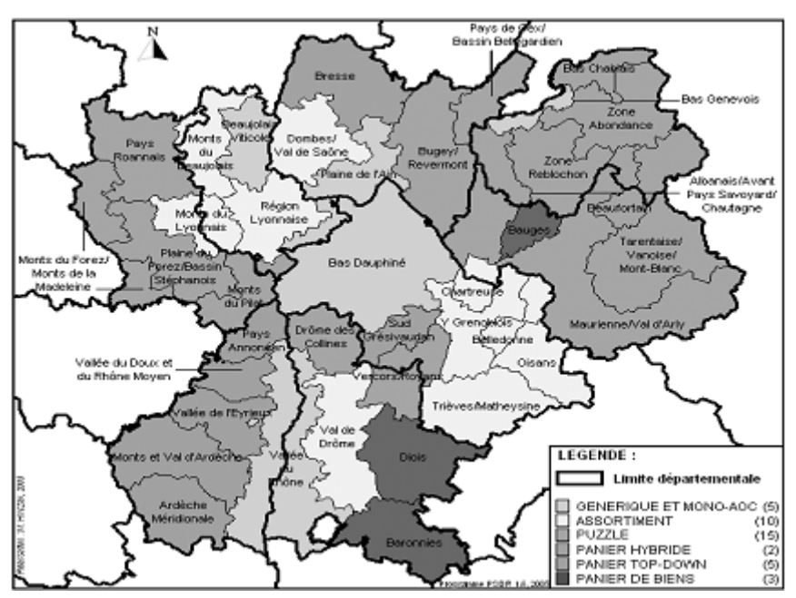
FIGURE 2 Typology of territorialized complex goods in the Rhône-Alpes région