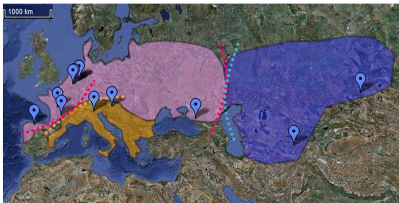
Figure 2. Map representing Neanderthal geographical distribution in groups.

First we used DNAsp software to extract a genetic differentiation parameters set from nucleotide sequences (haplotype number, haplotype diversity, nucleotide diversity and pairwise