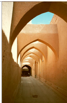
F.3: The narrowness of the semi-covered passageways and high walls along two sides of allays make shade in summer afternoons and protect the complex against the dusty desert winds.