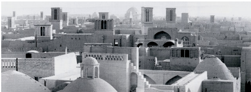
F.1: Skyline of the city made of clay and mud brick has been dominated by the domes and wind catchers. The structure of this compact city is open to the favourable winds that are drawn into the heart of city to ventilate the basements and deep courtyards.

The city has a 3000 year long history, dating back to the time of the Median empire, an ancient settler of Iran. In the course of history due to its distance from important capitals and its harsh natural surrounding, Yazd remained immune to major troops' movements and destruction from wars, therefore it kept many of its traditions, city forms and architecture until recent times