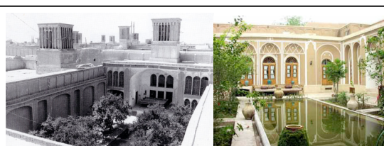
F.5: the two different courtyards that have made microclimates in the centre of traditional houses