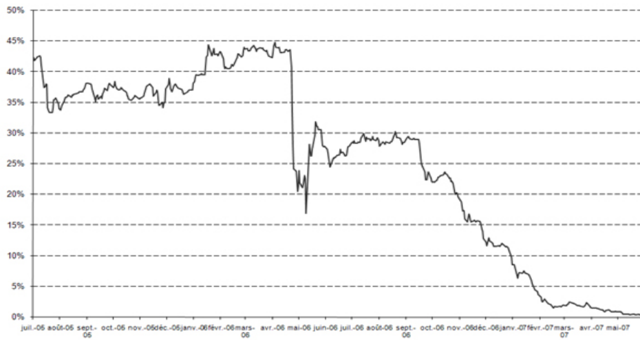
Figure 2: The probability of EUA allowances shortage at the end of the 1 st period