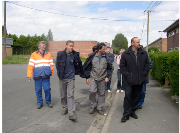
Figure 2: "Collective" visit with technicians of urban management.

"Commented visits" resulting from research led to "collective visits", which we almost systematically organize with actors associated with a given place: city officials and technicians, people working in urban management (lenders, teachers, postmen, city policemen, garbage collectors, people in charge of parks and green spaces and road maintenance etc.), users, representatives of associations or residents.