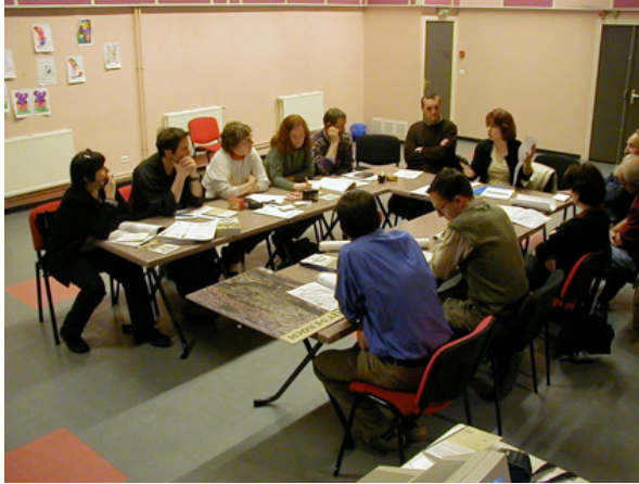
Figure 6: Multi-actor workshop. City of Saint-Etienne.

Atmospheres lie at a crossroads of various dimensions that help apprehend and understand them. This concept, which was developed at the Cresson and Cerma laboratories, in particular by Jean-François Augoyard (Augoyard 2007) or Pascal Amphoux (Amphoux 1998), identifies either a phenomenon or a place to be analyzed at a crossroads of several dimensions: the sensitive dimension (what appeals to our senses, what we feel), the technical dimension (buildings, road system, technical engineering) and the social dimension (practices, imagination of a place). This concept is particularly interesting for projects because if we position ourselves at a crossroads of different dimensions for the reading of a place and the development of its project, decisions are made by taking into account the complexity of the existing situation rather than in favour of an exclusive dimension that would only correspond to a partial vision of things. Building up a project by using all these data is more complex but also richer and more interesting as regards proposals, insofar as every actor can play a role in relation to his/her competences.