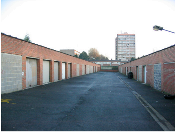
Figure 7: Hauts-Champs neighbourhood before renovation.

The Hauts Champs neighbourhood is made up of strips of house blocks, which belong to the Logiciel (CMH group) social landlord and is located in Hem, in northern France. Right in the middle of the blocks, more than 400 garages were built as mineral, closed spaces and dead ends. These dilapidated garages, separate from the houses, are sometimes used for unlawful activities. The way they are positioned has contributed to develop a feeling of insecurity that has been slowly enhanced by the garages left vacant.