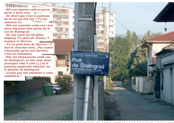
Figure 4: Residents reading Echirrolles' urban fabrics – "visit album".

This involves thinking about how elements can be renewed and continuously substituted without distorting the coherence and efficiency of the city as a whole. Lastly, working on urban fabrics amounts to admitting that several fabrics co-exist next to one another in the city, thereby making up a whole. At least in theory, this inevitably raises the standing issue of how links can be woven between urban fabrics of different times or natures.