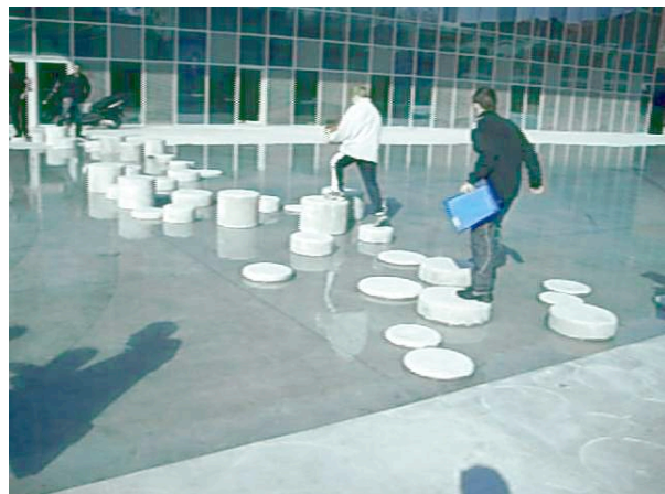
Figure 3: "A square for three neighbourhoods" - 2007 - Djamel Klouche's and Jan Kopp's project following the BazarUrbain study (2005).

The principle always consists in returning something to those who accepted to give some of their time. These "albums" may be handed over at a public meeting. Individual presentations are multiplied by those delivered by the others, and thus become polyglot. The experience is shared; the knowledge of the place is built up in small touches that will then be refined through other approaches.