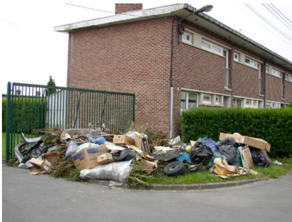
Figure 8: Entrance of a collective backyard.

The Hauts Champs neighbourhood is made up of strips of house blocks, which belong to the Logiciel (CMH group) social landlord and is located in Hem, in northern France. Right in the middle of the blocks, more than 400 garages were built as mineral, closed spaces and dead ends. These dilapidated garages, separate from the houses, are sometimes used for unlawful activities. The way they are positioned has contributed to develop a feeling of insecurity that has been slowly enhanced by the garages left vacant.