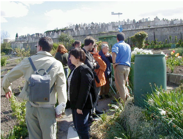
Figure 1: "Collective visit" – Saint-Etienne.

A "situated account" consists in describing a place and its customs orally while being on the spot, thus allowing a confrontation between an oral representation and the "reality" of the land. The "shared account" which takes place inside a group helps introduce time, bodies and customs in real-life situations. It also makes people aware of individual and collective representations and permits laying the foundations of a common experience.