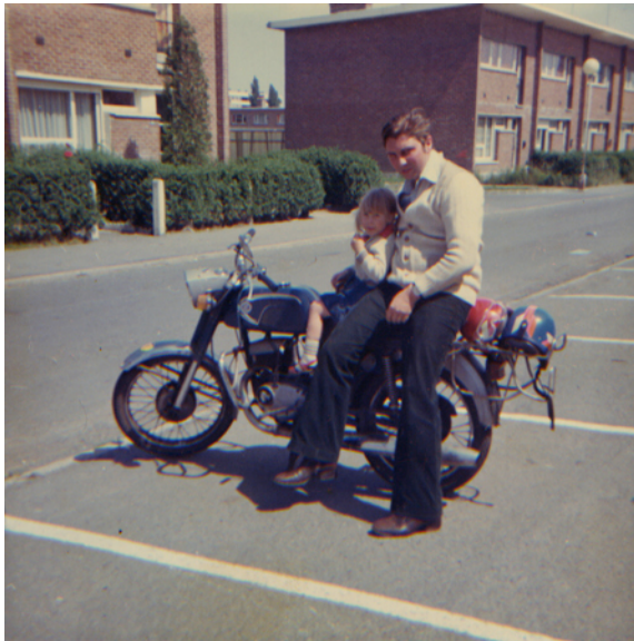
Figure 10: Photo extract from a family album – exhibition book.

the initial urban project (in the late 50s) with its developments will be published.