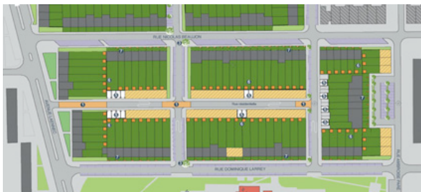
Figure 11: Overall plan - project.

- Design consists in producing scenarios to develop the hearts of the blocks and mass plans taking into account both the residents' ways of life and urban reality with its developments on every scale (urban organization maps, cross section of a street, housing approval proposals). Regarding this phase, the residents' contribution was crucial to subtly identify local issues (e.g. the need for storing spaces), rely on existing practices (rainwater collection...) and pinpoint the challenges and scales caused by inevitable transformations.