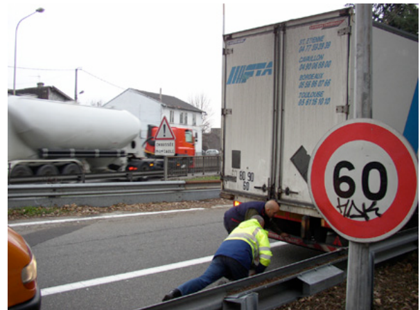
Figure 5: "embedded journey" with the patrolman on the motorway.

Users dismantle some myths and planning reflexes. Their aesthetic vision may surprise taste experts. The same goes for the way people look at the "necessity" of standardizing a road. Although no driver is against road improvement, some will mention the pleasure they feel when driving on old highways, as opposed to being driven on new highways.