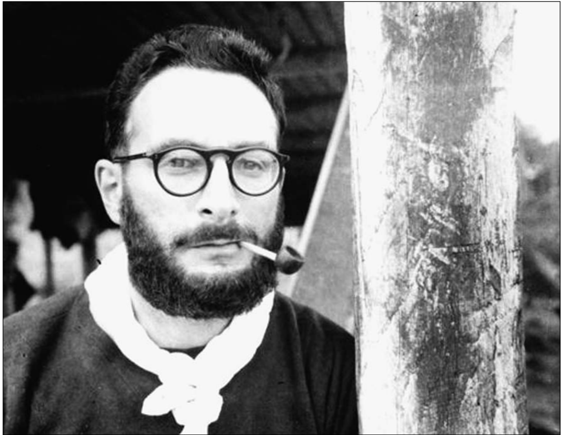
Fig. 1. The young Lévi-Strauss as fieldworker and adventurer.