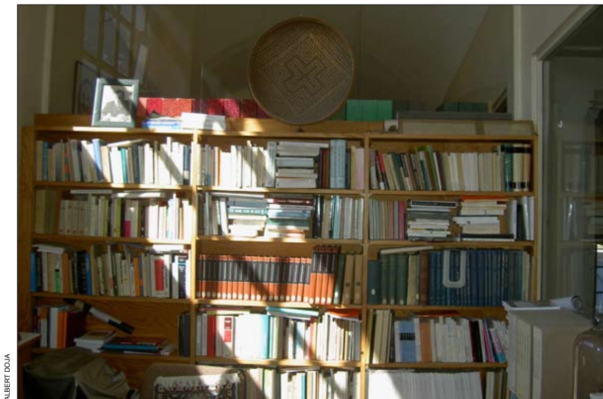
Fig. 2. Claude Lévi-Strauss' office in Paris.

become synonymous with post-modern theory of various sorts, but anthropology has been viewed as an arena particularly appropriate to the post-modernist agenda, especially with regard to unpacking of some of its key terms and concepts such as 'otherness' and 'culture'.