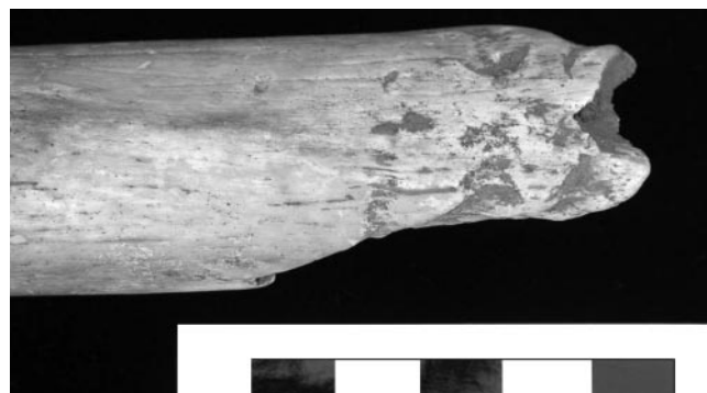
Fig. 3. Details of the carnivore toothmarks on the distal end of the RdV 1 human femur diaphysis.

Homo femora in general (16–21), have largely subcircular mid-shaft subperiosteal contours, variable development of a medial buttress, a variably prominent linea aspera , and no evidence of a pilaster. In addition, it is sometimes difficult to distinguish both lips of the linea aspera on Neandertal femora, because they are united in a single relief forming a soft crest. Although some Late Pleistocene modern human femora approach this cross-sectional morphology (22, 23), they usually have tear-drop shaped cross-sections, prominent pilasters, and flat or especially concave surfaces adjacent to the linea aspera . The RdV 1 femur exhibits most of the archaic Homo femoral diaphyseal features and contrasts with the femora of early modern humans; its midshaft cross-section is almost round with a continuously convex contour; there is little projection of the linea aspera , no flattening adjacent to the linea aspera , and, hence, no pilaster. Even though one could find a gracile recent human femur with a similarly