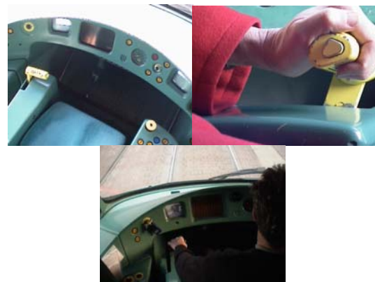
Photos 9 à 11: Photos 9-11: Eurotram control cab - Throttle, alarm and dead-man - Action on the throttle

In Strasbourg, a city equipped with the Eurotram cars, the hand-held throttle, positioned on the left armrest of the driver's seat (Photo 9), was not appreciated primarily because of the pronounced difficulty involved in using the armrest to relax the forearm while operating the throttle (Photos 10 and 11). Moreover, the presence and placement of both the bell and dead-man device on the throttle considerably constrained the driver's hand and forearm position, which was the focal point of the criticisms lodged. The selected model was inspired from the “joystick” controls in place on the Combino tramway, produced by Siemens. It should be pointed out that on the Combino design, used in Freiburg (Germany), this throttle also serves to monitor driver vigilance. The traction and braking controls eliminate the need to activate an autonomous dead-man device. As the tram is traveling along at coasting speed, i.e. when the throttle is idle, the driver must still keep it held down. Nonetheless, the proposal of directly using the throttle as a source of information on the driver's active presence and thereby avoiding association with any specific device, while still forwarded, did not win support for “technical” reasons.