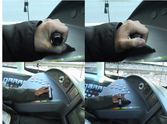
Photos 5 à 8: The Citadis rotary throttle, in both its theoretical and practical applications

This reexamination led to producing a rotary hand-held throttle fitted with a sensitive contact for the dead-man function. Yet, it could be observed that the action “script” incited by the shape of the object (Akrich 1987), i.e. taking control of the throttle in the palm of the hand and a thumb-triggered contact (Photos 5 and 6), cannot be performed smoothly and efficiently. Instead, the sideways, clasped hand position often tends to be preferred (Photos 7 and 8), in association with the pedal activation of the dead-man function that was requested by drivers. The problem then of potential inaccessibility to the dead-man actuator coupled with the hand-held throttle has thus been averted. Consequently, no critical feedback on hand-held throttle design is to be gleaned, even if its use does not entirely correspond with designer expectations.