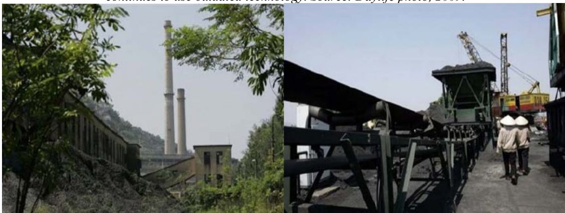
Figure 1: The Ninh Binh conventional coal-fired power plant was constructed over 20 years ago and continues to use outdated technology.

To meet the increasing demand for electricity services expected in 2010–2030, Vietnam can rely largely on domestic coal reserves, which were estimated at 3.8 million tons as of January 2002 and are 85% anthracite coal (heat value ranges between 5200 kcal/kg and 5700 kcal/kg). Over the period of 2002–2020, the qualified coal yield is expected to increase from 13.8 million tons to 30 million tons per year, and it could reach 40 million tons per year in 2030. To exploit this resource, an intense generation capacity expansion plan based on coal-fired generation is already underway (Institute of Energy, 2006, 2007). So far, all coal-fired generating plants that have already been committed to and those planned in the years leading up to 2015 are based on conventional pulverized and circulating fluidized bed technologies. Advanced and cleaner coal-fired technologies such as IGCC and PFBC are not yet included in the long-term generation capacity expansion development master plan. If barriers to the adoption of these technologies can be overcome, overall efficiency will be significantly increased.