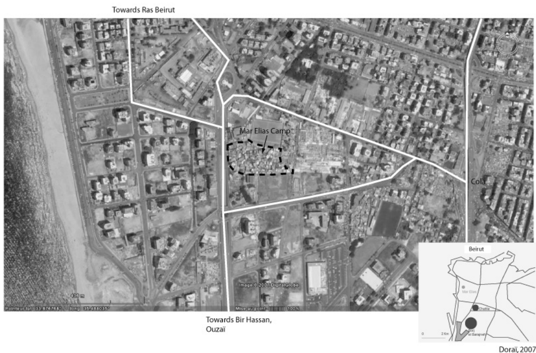
Map 1: Location of Mar Elias Refugee Camp

Mar Elias camp was created in 1952 by UNRWA, on an area of 5,400 square meters in the southwest part of the Beirut municipality. In 1958, according to UNRWA figures, the camp hosted 449 registered refugees and 612 in 2005. 14 The camp was established adjacent to Mar Elias Greek Orthodox convent. Today, the camp is situated at the crossroads between Beirut's southern suburbs of Bir Hasan and Uza'i on the one hand and Ras Beirut and Cola intersection on the other (see Map 1). This central location facilitates circulation both for camp dwellers who can easily reach other neighbourhoods in Beirut and for people from outside the camp wishing to come to the camp, whether they are from Beirut or from other regions of Lebanon (especially the southern coastal region).