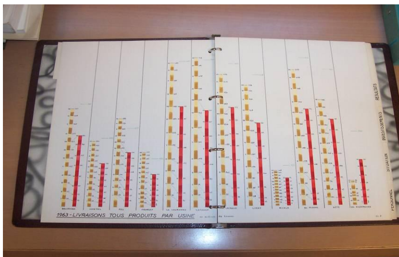
Figure 1. Tableau de bord of the Managing Director of Lafarge in 1963: deliveries of all products per factory.