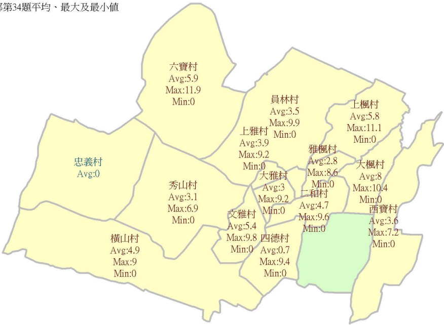
Figure 1: The surveyed data concerning question 34 for each Daya village includes its maximum, minimum, and average values which are shown by an GIS system.

Figure 2 shows the similar results of the same question concerning Situn District. The light blue, light green and pink bars, respectively, represent average, maximum, and minimum values. The shadowed villages represent their minimum value is 0, i.e., no resident is interviewed.