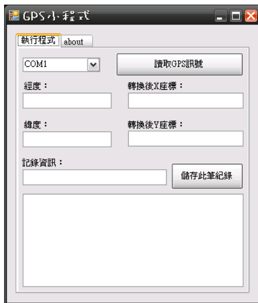
Figure 3: The positioning interface of our GPS tool.

Figure 3 shows the tool's interface. After a user clicks down “讀取GPS訊號”(reading GPS signal”), it starts receiving GPS signal and decoding the signal. GPS signal consists of interviewed resident’s home longitude and latitude which will be sent to ESRI ArcGIS. So, the signal should be transformed to X-Y coordinates which are shown on “轉換後X座標” (transformed X coordinate) ” and “轉換後Y座標”(transformed Y coordinate) ”. We should also key in