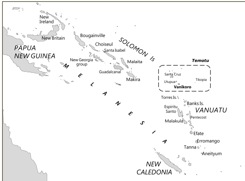
Map 1: Location of Vanikoro in the Pacific