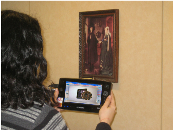
Figure 4: An example of an Augmented Reality mobile museum guide

category "Museum data management", with the term management embracing the storage, transmission and processing of data. Registration of visitors terminals, that allows museum staff be aware of the number of visitors in each room as well as logs of visitors actions belongs in this category, as well as geolocalisation, orientation and live streaming. Modules for content creation, content management and content update can also fall under this category.