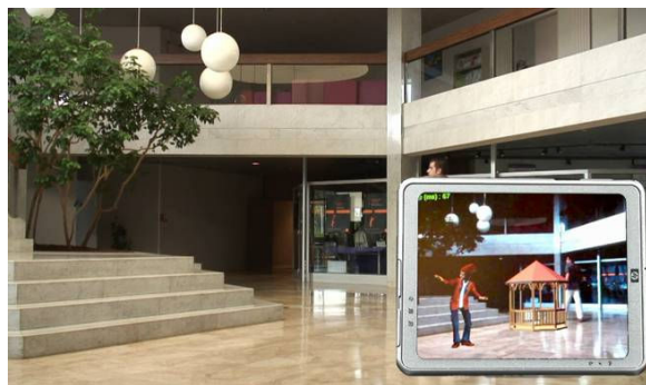
Figure 2: Augmenting the real world with digital overlays

And though the above mentioned issues might constitute only a part of the challenges present in the domain of mobile multimedia guides used in the museum setting, they lie in the core of a successful integration of mobile guides in the museum setting and they are by no way trivial.