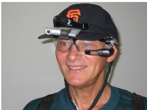
Figure 3: An example of a wearable Augmented Reality display