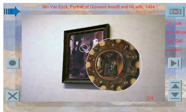
Figure 5: Augmenting the painting with a detail

In at least one mobile museum guide project personalized souvenirs were proposed to the visitor (Sauer et al., 2004). As all visitors actions are logged, useful data regarding the sessions can be retrieved and help in redesigning or better adapt to visitors' needs the guide. But there is also another possibility, already explored and published by the Cite des Sciences et d' Industrie in Paris (Topalian, 2005). As the visitor returns the terminal, he receives a postcard onto which there is a url printed. The visitor can access the content of the web pages once in front of a PC and visualize the objects he visited and the path he followed whilst in the museum premises. In that way the visit is extended beyond the museum and the visitor is given the chance to examine further specific objects or aspects of the exhibition.