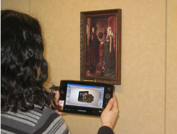
Figure 4: An example of an Augmented Reality mobile museum guide

category "Museum data management", with the term management embracing the storage, transmission and processing of data. Registration of visitors terminals, that allows museum staff be aware of the number of visitors in each room as well as logs of visitors actions belongs in this category, as well as geolocalisation, orientation and live streaming. Modules for content creation, content management and content update can also fall under this category.