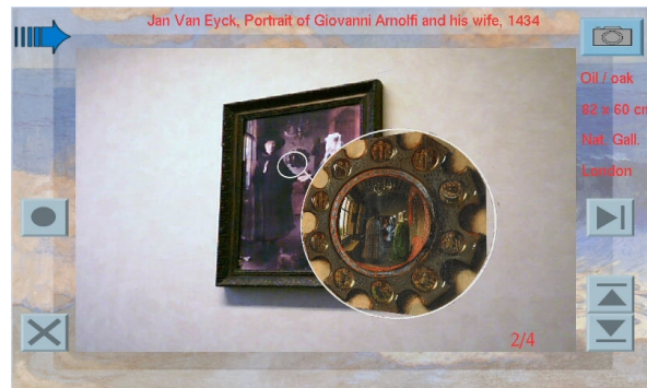
Figure 5: Augmenting the painting with a detail

In at least one mobile museum guide project personalized souvenirs were proposed to the visitor (Sauer et al., 2004). As all visitors actions are logged, useful data regarding the sessions can be retrieved and help in redesigning or better adapt to visitors' needs the guide. But there is also another possibility, already explored and published by the Cite des Sciences et d' Industrie in Paris (Topalian, 2005). As the visitor returns the terminal, he receives a postcard onto which there is a url printed. The visitor can access the content of the web pages once in front of a PC and visualize the objects he visited and the path he followed whilst in the museum premises. In that way the visit is extended beyond the museum and the visitor is given the chance to examine further specific objects or aspects of the exhibition.