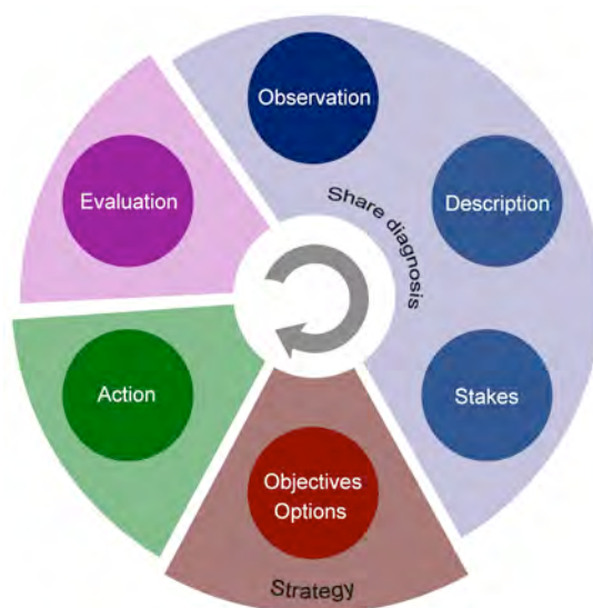
Fig. 2: Process wheel

The process was conceived to be cyclic and continuous, in a dynamic of permanent and directed strategic scanning along strategic axes. Schematically, the process can be represented by a “strategic wheel”.