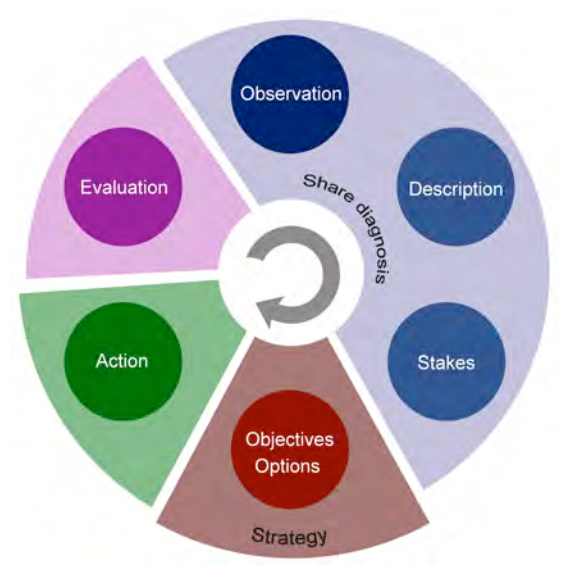
Fig. 2: Process wheel

The process was conceived to be cyclic and continuous, in a dynamic of permanent and directed strategic scanning along strategic axes. Schematically, the process can be represented by a "strategic wheel".