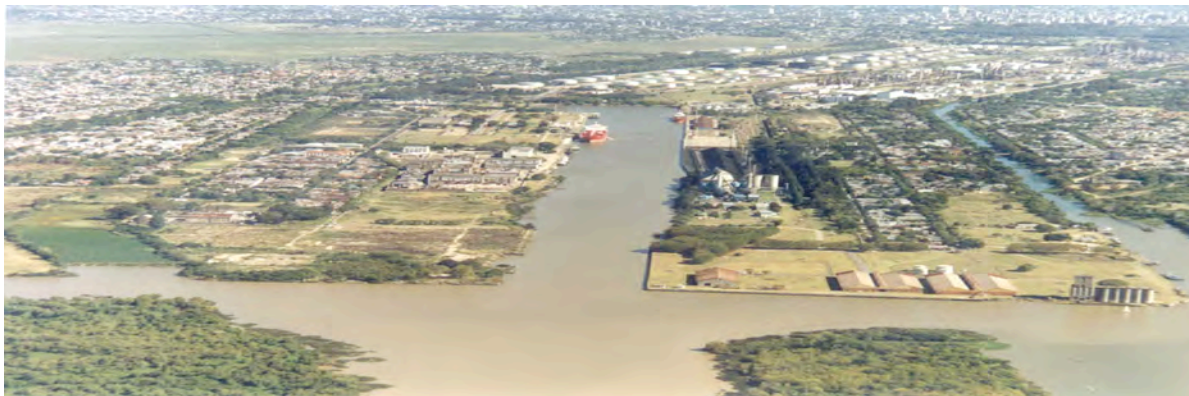
Image 3. La Plata Port. View from Río de La Plata river towards the Cuatro Bocas channel (center of the image) and Petrochemical pole (Repsol YPF distillery). On the right, city of Ensenada, on the left, city of Berisso.

As a result of this, it has been proposed to study the socio-economic feasibility of taking the Barrio Campamento neighborhood (5 blocks) and incorporating this zone into the area of port operating procedures as one of the work hypothesis in the Master Plan and Port Zoning. One of the proposals revolved around the Refunctionalization and relocation of 5 blocks, over a total of 9 blocks that the neighborhood currently has, there will be 4 left.