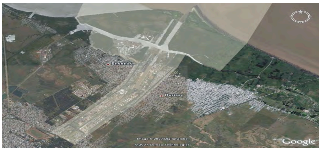
Image 2. Satellite Image corresponding to the port area of La Plata. The Port Jurisdiction appears shadowed.

From what has been stated above, there arises the Coexistence of occupations and possessions of lands with different legal precepts of permit, usufruct or use, by companies, organizations and institutions that emphasize the complexity of the area when it comes to making an integrated plan of management and control. For instance, when it comes to making the Master Plan and Port Zoning according to the records in the Provincial Administration of Ports it can be quoted here that there existed a total of 107 permits of use; from Industries themselves to development, sport, professional, educational, recreational, private, among other, institutions.