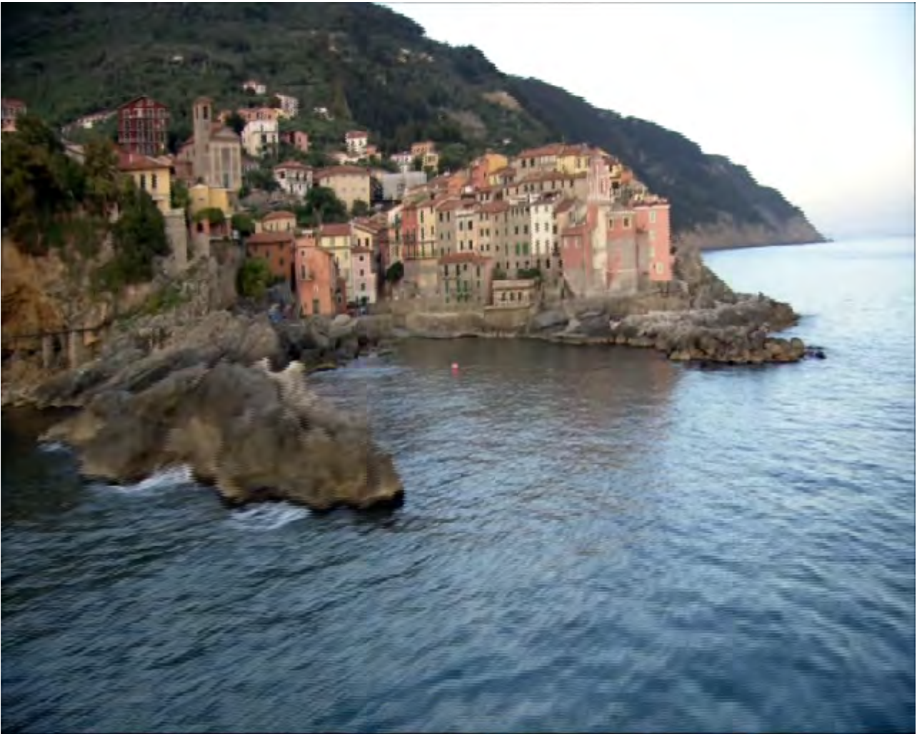
Fig. 5 Liguria/costiera sorrentina/praiano/vicoequense/cetara/erchie