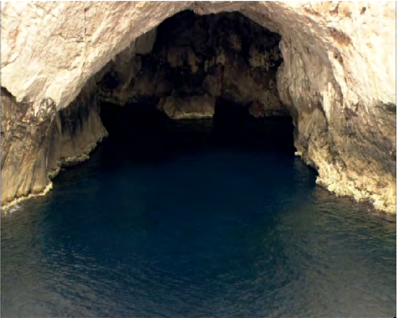
Fig. 8 Sardegna/Grotta dello smeraldo Atrani/grotta azzurra -Capri