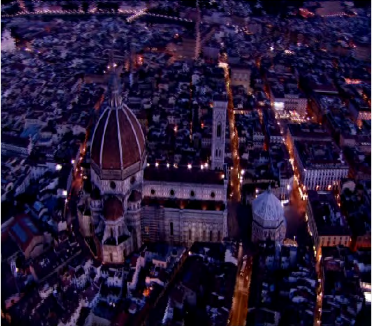
Fig. 1 Firenze

guardianship, and it is possible to have a more efficient control of and on the landscape.