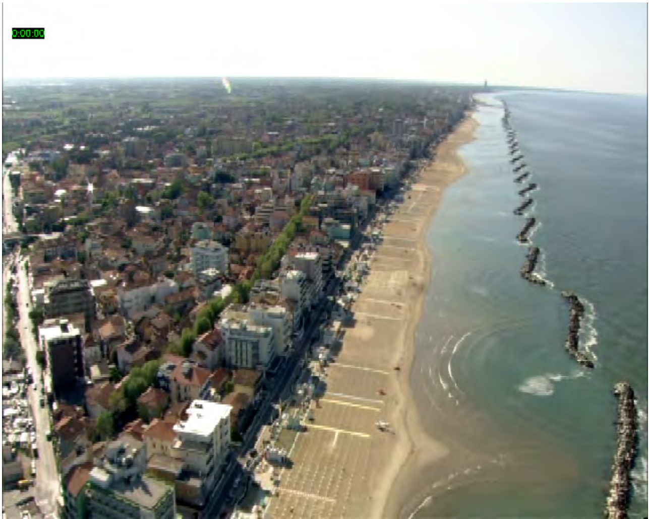
Fig. 3 Emilia Romagna / costa salernitana