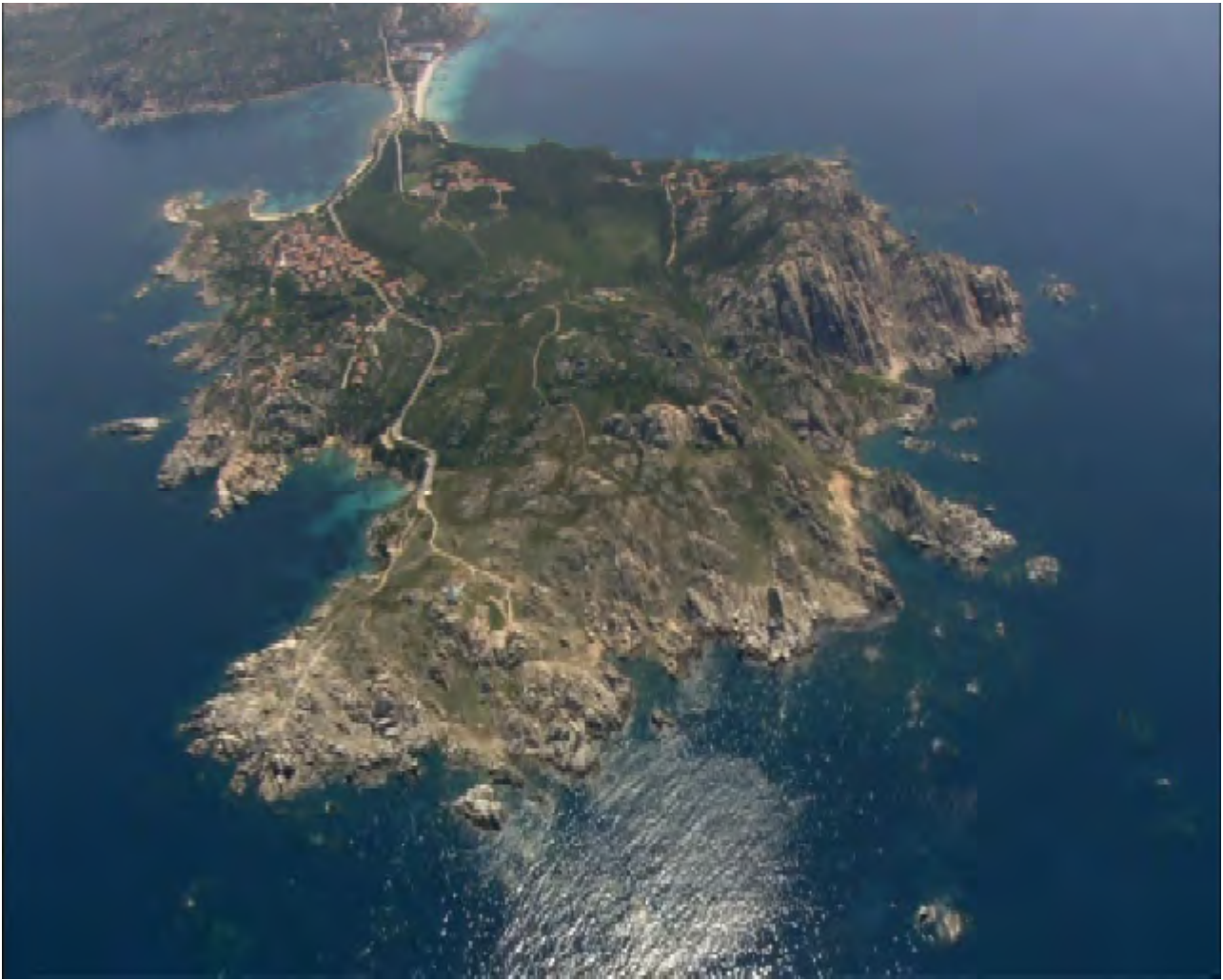
Fig. 7 Sardegna/sole campane