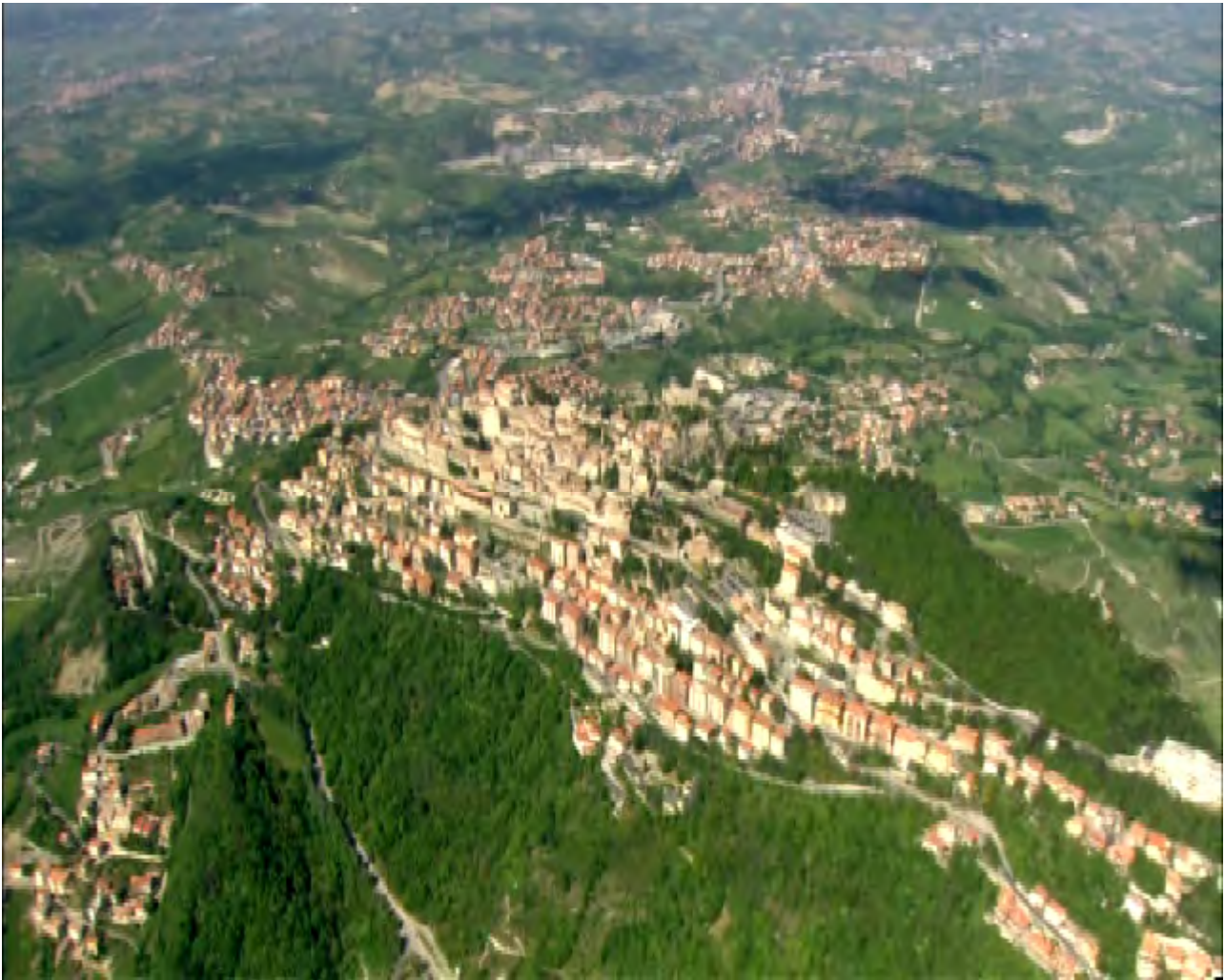
Fig. 4 Emilia Romagna/Monti picentini/ Giffoni