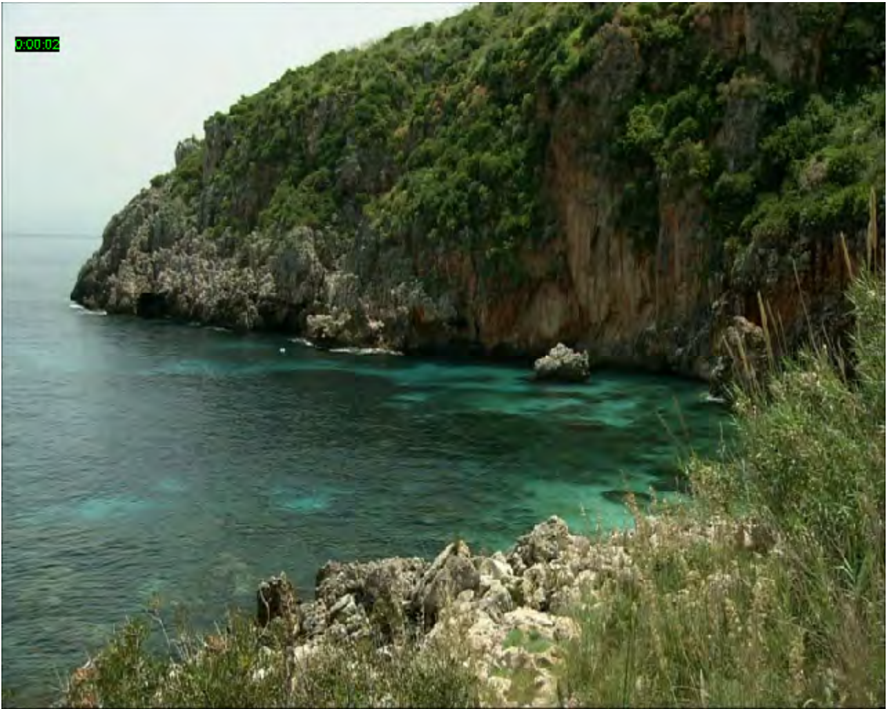
Fig. 6 Sicilia/costiera amalfitana-sorrentina/ricorrenza elementi di vegetazione