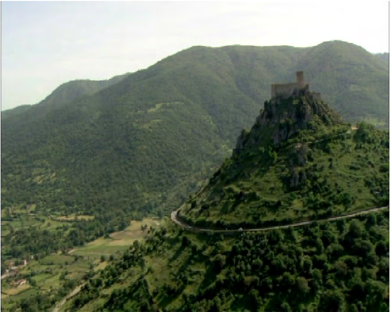
Fig. 9 Sardegna/castelli in Campania (Arechi)