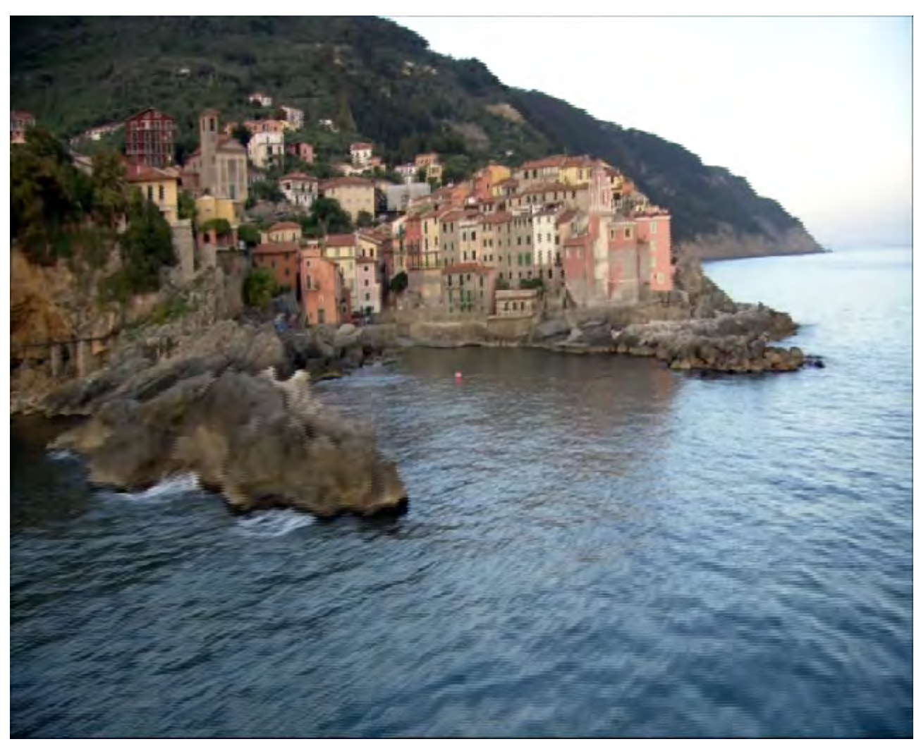
Fig. 5 Liguria/costiera sorrentina/praiano/vicoequense/cetara/erchie