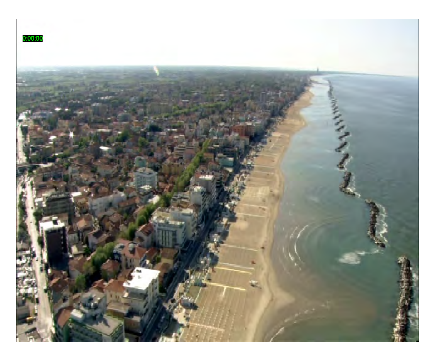
Fig. 3 Emilia Romagna / costa salernitana