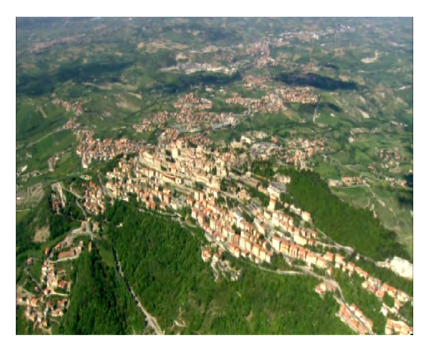
Fig. 4 Emilia Romagna/Monti picentini/ Giffoni