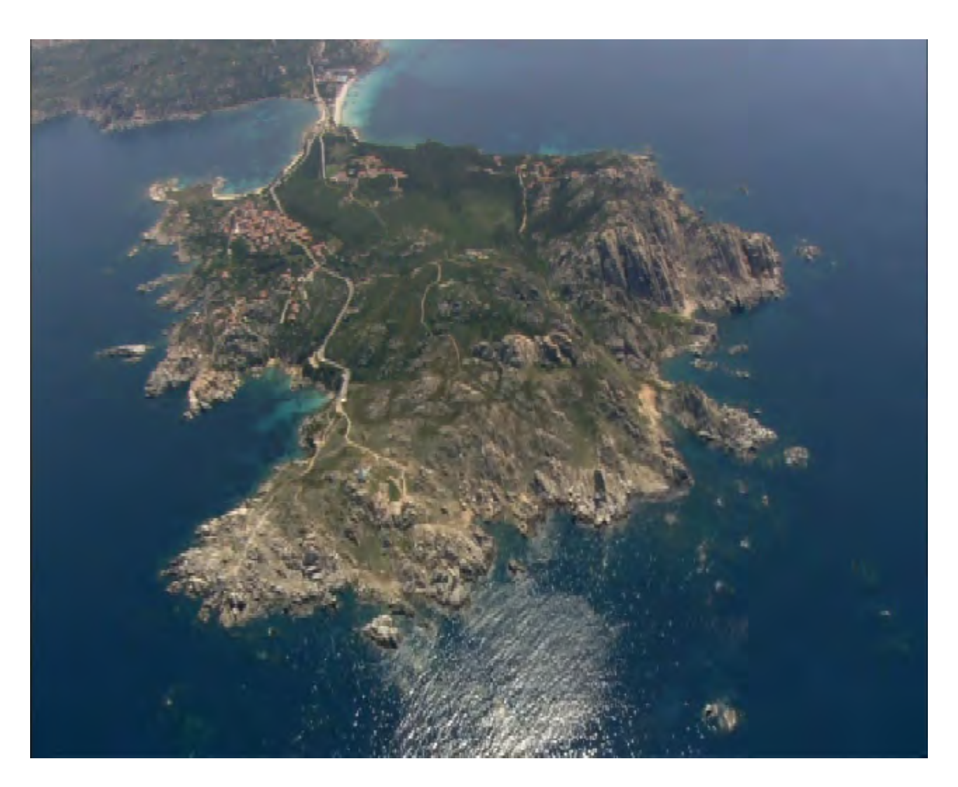
Fig. 7 Sardegna/isole campane