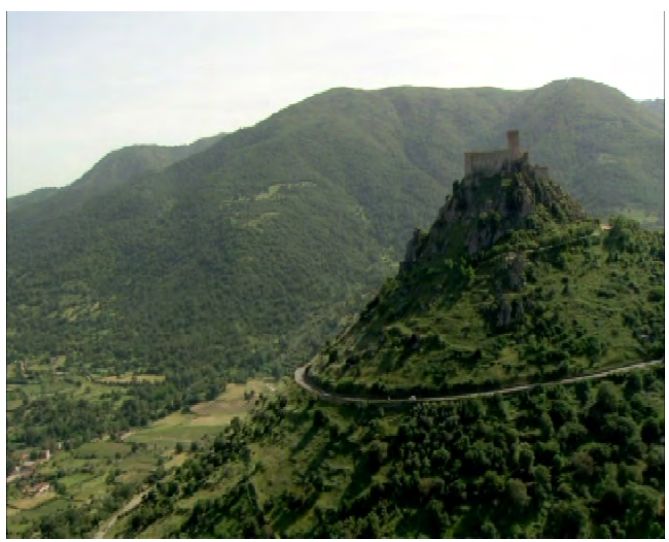
Fig. 9 Sardegna/castelli in Campania (Arechi)