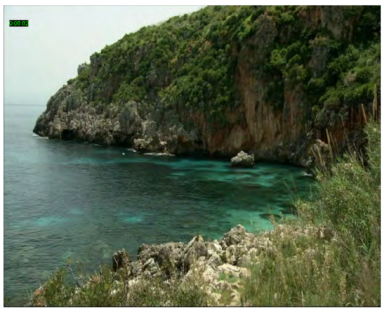
Fig. 6 Sicilia/costiera amalfitana-sorrentina/ricorrenza elementi di vegetazione