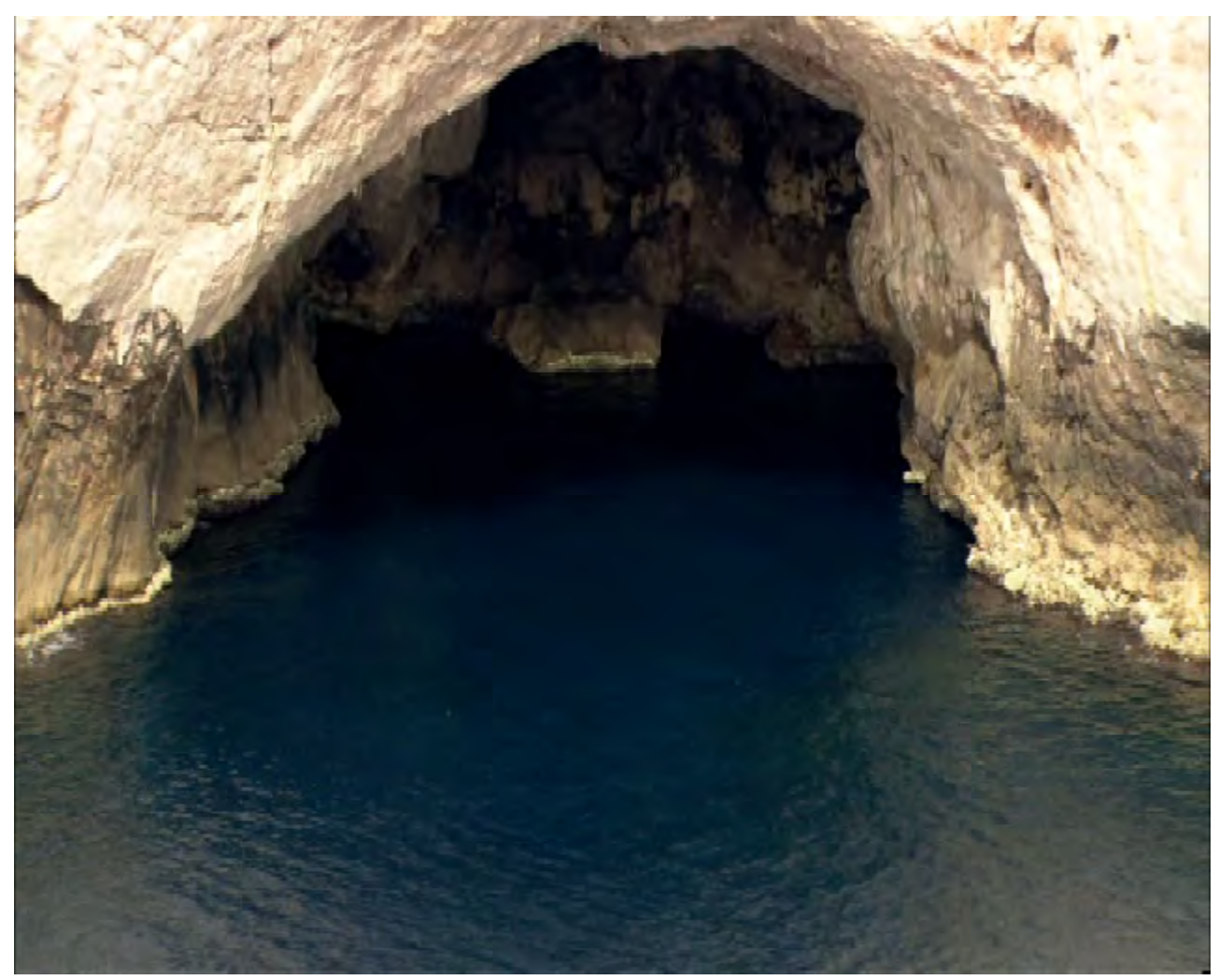
Fig. 8 Sardegna/Grotta dello smeraldo Atrani/grotta azzurra -Capri