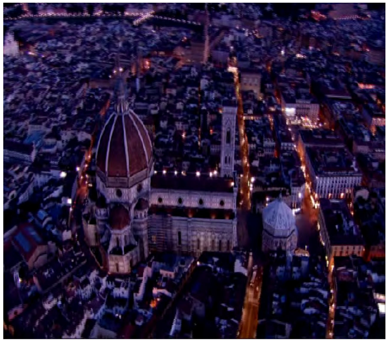
Fig. 1 Firenze

guardianship, and it is possible to have a more efficient control of and on the landscape.