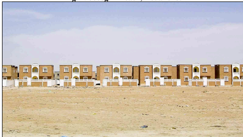
Fig. 2: Socogim Beach, Nouakchott